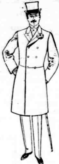
Copyright 1897 by The Stein-Bloch Co.