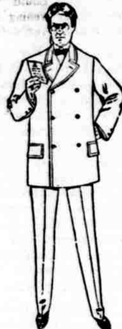
Copyright 1897 by The Stein-Bloch Co.