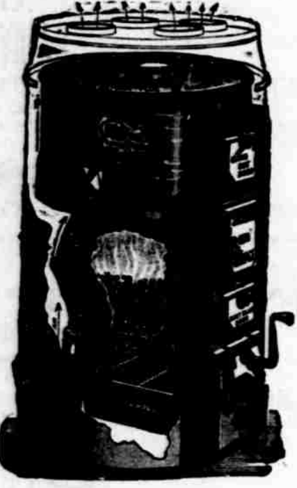
if they only knew the small amount of money required to obtain # # a first class & & & &