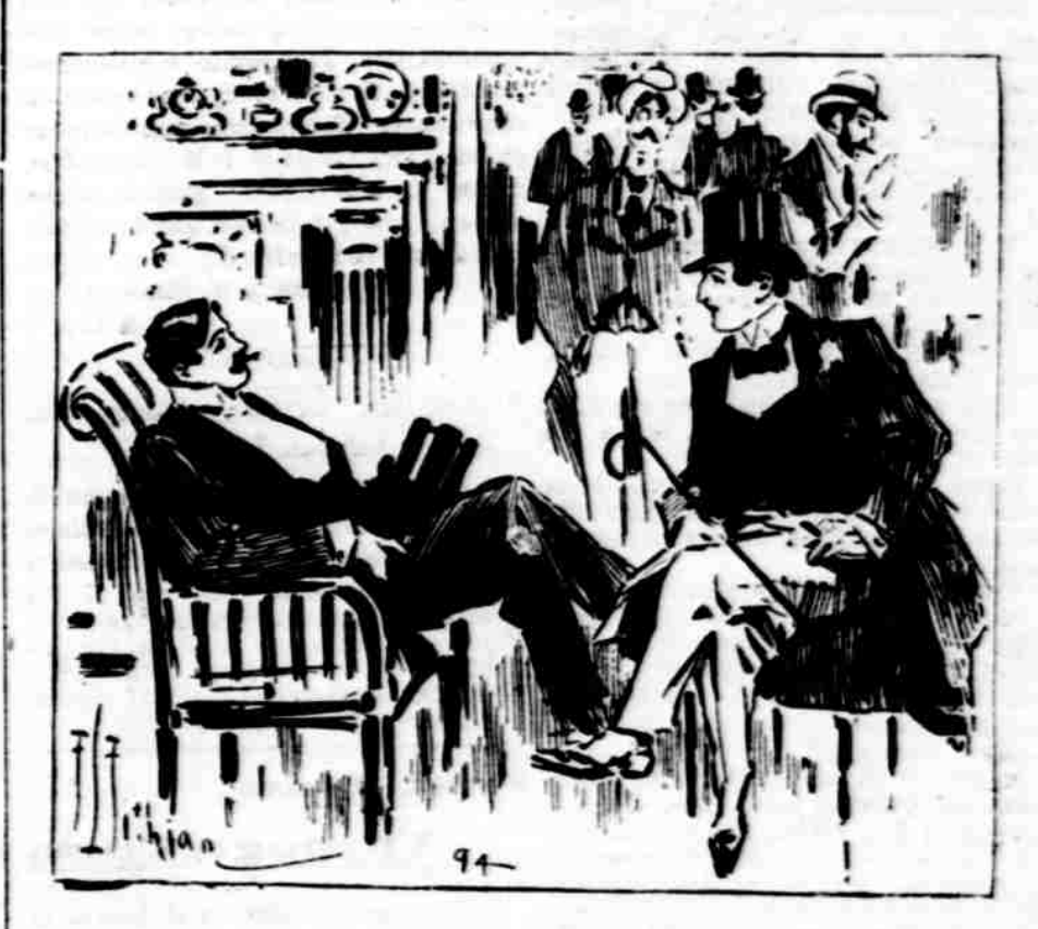
Chollie-I proposed to Miss Bashfulle last night, dontcherknow, and she wequested me not to pwees her for a weply. Reggie—Must have thought you took her for one of those talking dolls deah