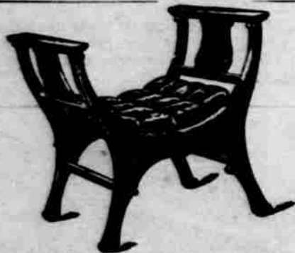
Roman chair, Mahogany finish, $8.65.