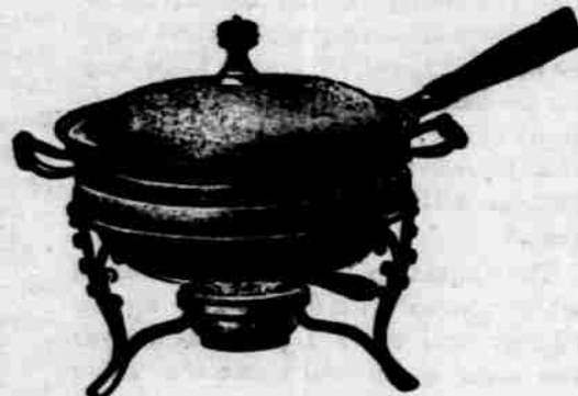
Large stock chafing dishes from $3 to $10 each.