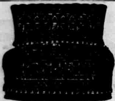
Fine silk Brocade, $16.00.