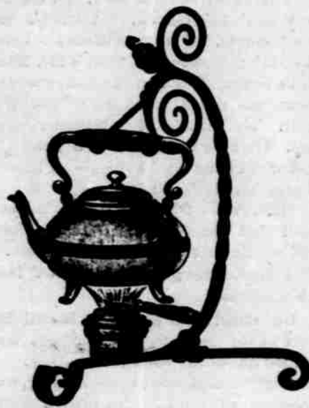
Ten different styles in 5 o'clock tea's from $2.50 to $8.00 each.