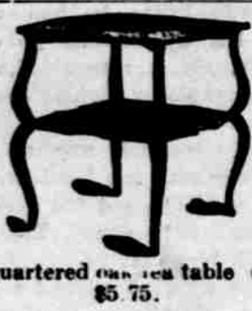
Quartered oak tea table only $5.75.