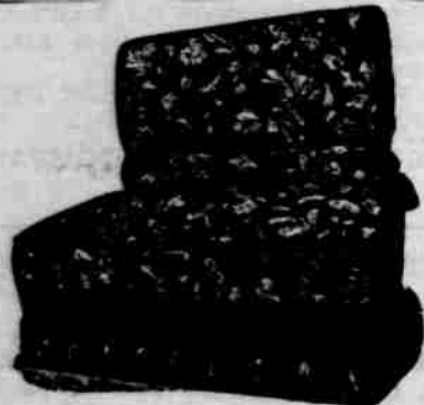
Spanish Divan, Finest silk Brocade, $18.00.