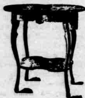
Fire quartered oak parlor stand $6.50.