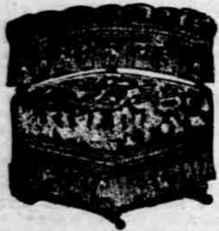
Corner chair, upholstered, silk tapestry, $7.00.