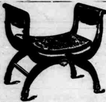
Window chair, a beauty at $9.45.