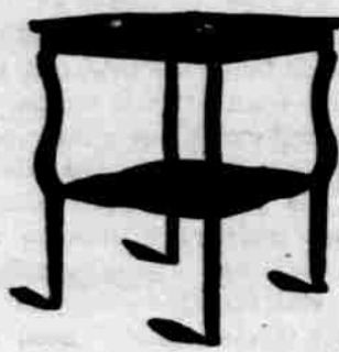
Oak parlor table, quartered oak, only $2.50.