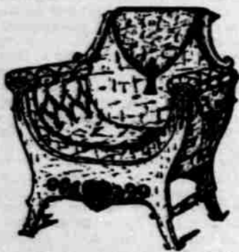
Solid Mahogany, finely upholstered, $25.00.