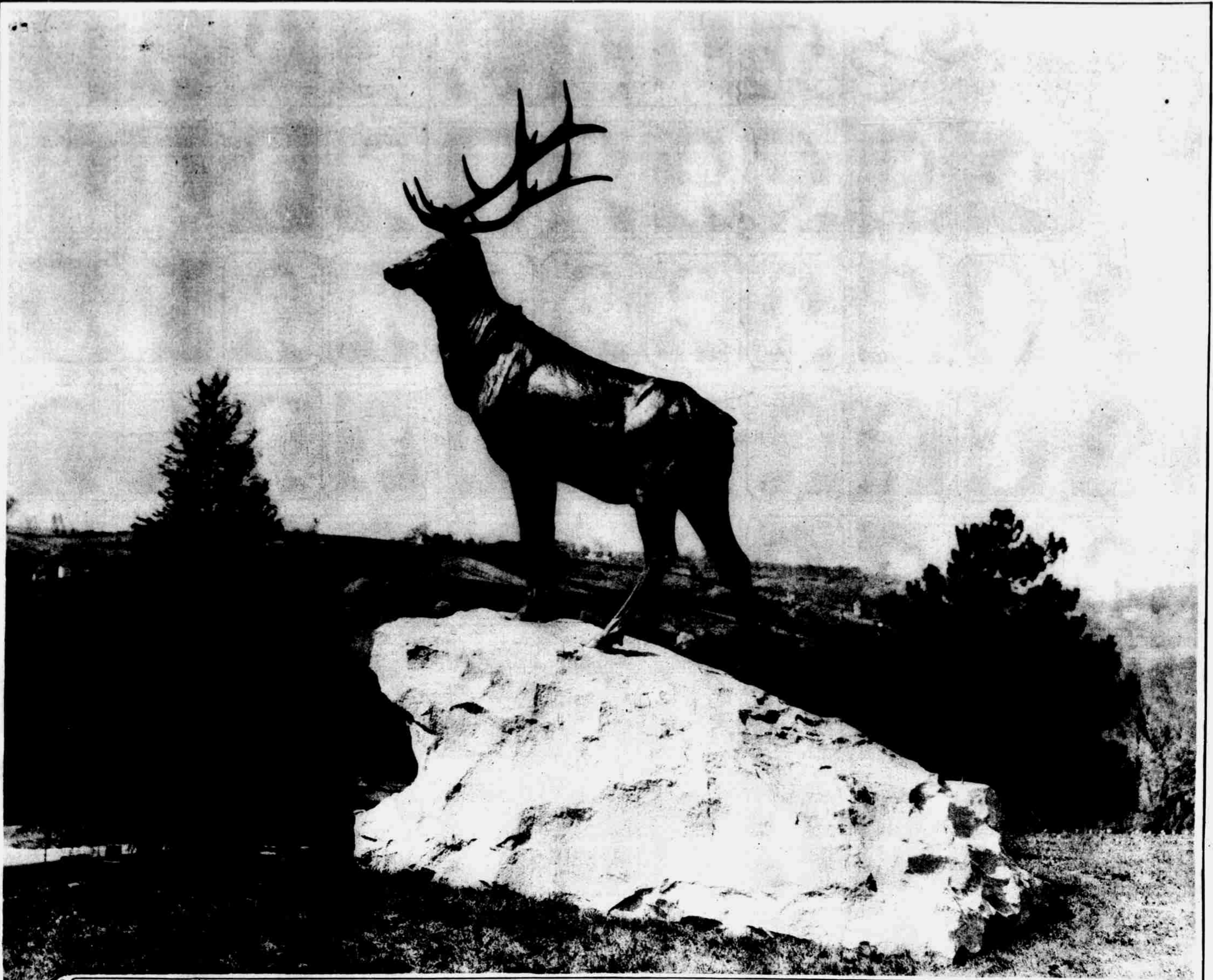
This Bronze Elk Memorial to deceased Members of Omaha B.P.O.E., now stands on the crest of Elks Rest overlooking a Valley of graves in Forest Lawn Cemetery. It was dedicated at 11-P.M. May 12.