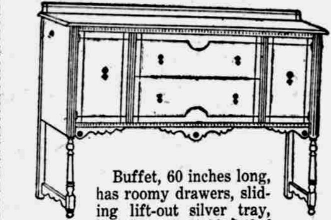
Buffet, 60 inches long, has roomy drawers, sliding lift-out silver tray, cupboards with divided shelves.

A Clever New 8-Piece Dining Room Suite in Kensington two-tone Walnut $198 In design exactly as illustrated.