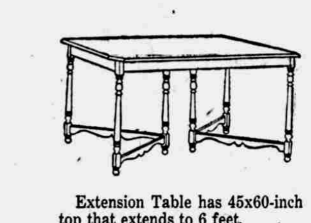
Extension Table has 45x60-inch top that extends to 6 feet.