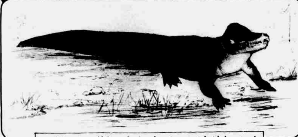
"Oscar" wouldn't get far in a beauty contest, but he's not such a bad sort, at that, his keepers claim. He's one of the Riverview park 'gators.