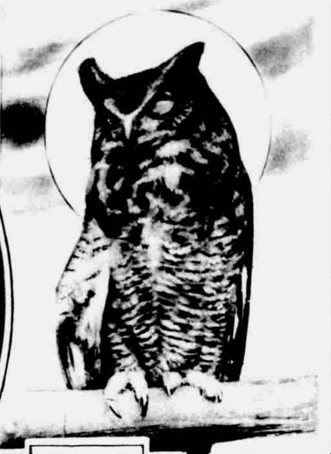
Hoot mon, 'tis our old friend, "Sleepy," Riverview park owl.