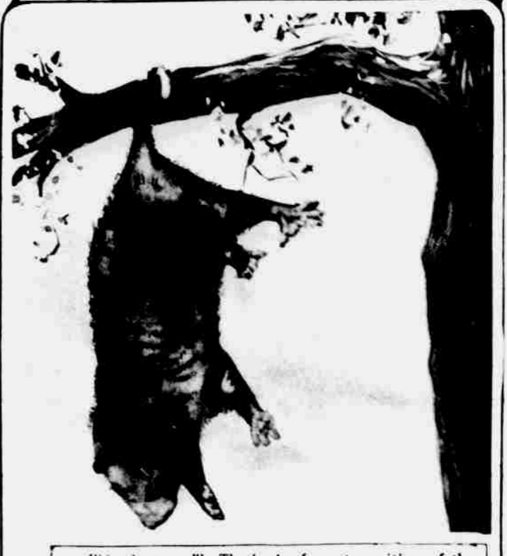
"Heads down!" That's the favorite position of the Riverview park opossum.