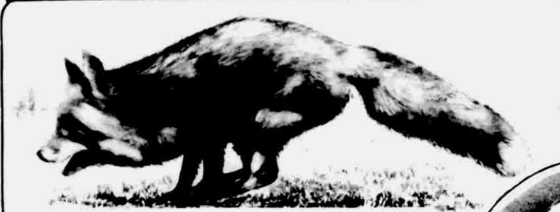
The red fox at Riverview objected to newspaper publicity and absolutely refused to pose. So the camera man took a snapshot as reynard sped away.