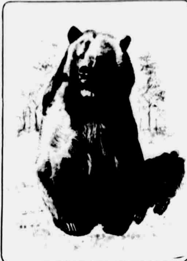
"Dick," the grizzly, loses his usual grouch at lunch time at Riverview and sits up to be fed.