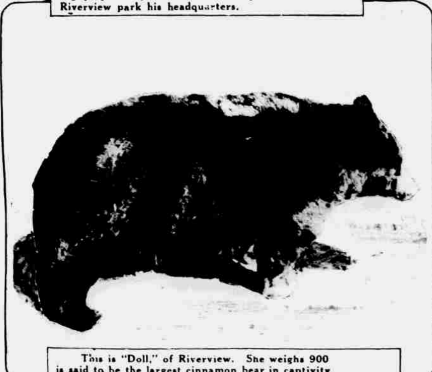
This is "Doll," of Riverview. She weighs 900 and is said to be the largest cinnamon bear in captivity.