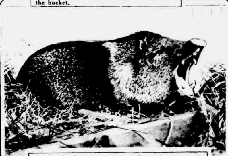
No, "Jumbo" isn't in the act of snapping someone's head off. That's merely a yawn in which he's indulging, preparatory to an afternoon nap. "Jumbo" makes Riverview park his headquarters.