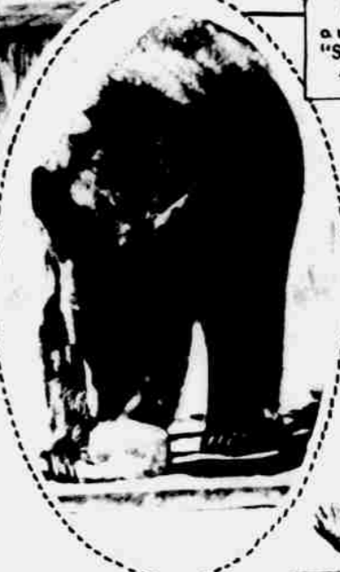
"Mabel," black bear at Riverview park, orders her sandwiches by the pound. The camera man caught her partaking of light mid-day refreshment.