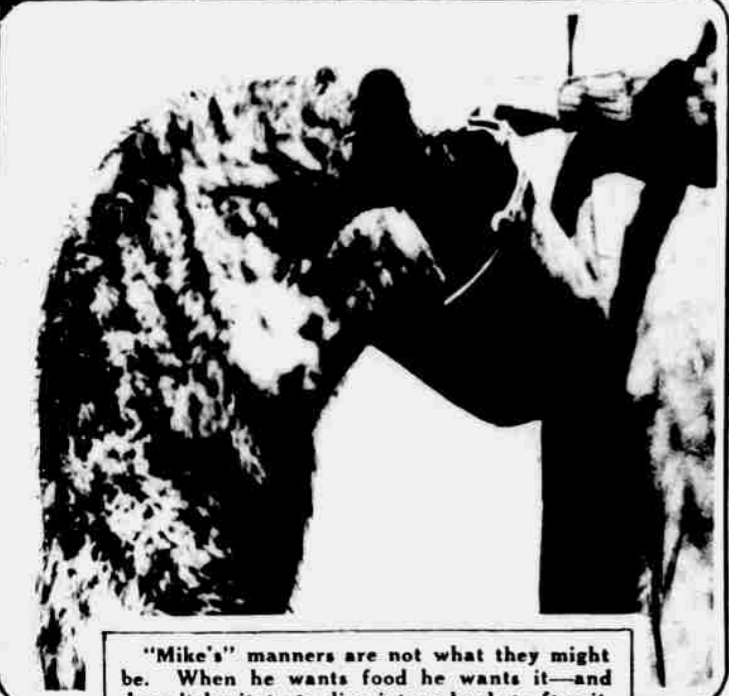
"Mike's" manners are not what they might be. When he wants food he wants it—and doesn't hesitate to dive into a bucket after it, if need be. Guess what he got? There was half a pound of chocolates in the bottom of the bucket.