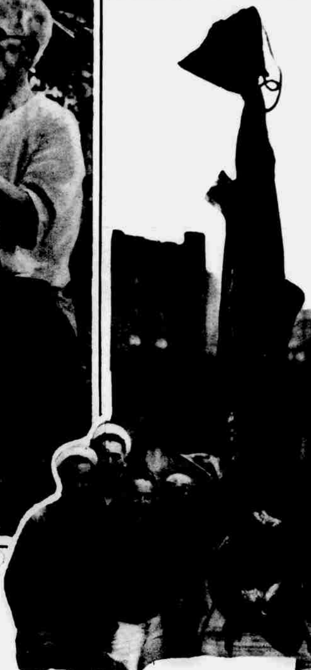
Above—An extraordinary "catch"—a 700 pound shark caught by a Seattle policeman in Seattle harbor—the largest one man catch on record.