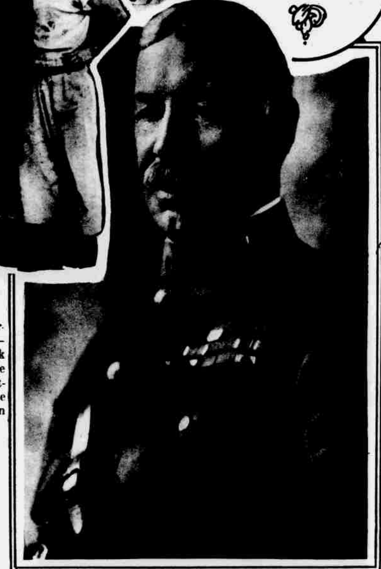
A new photograph of Major Gen. Mason, who is Chief of the Air Service of the United States Army.