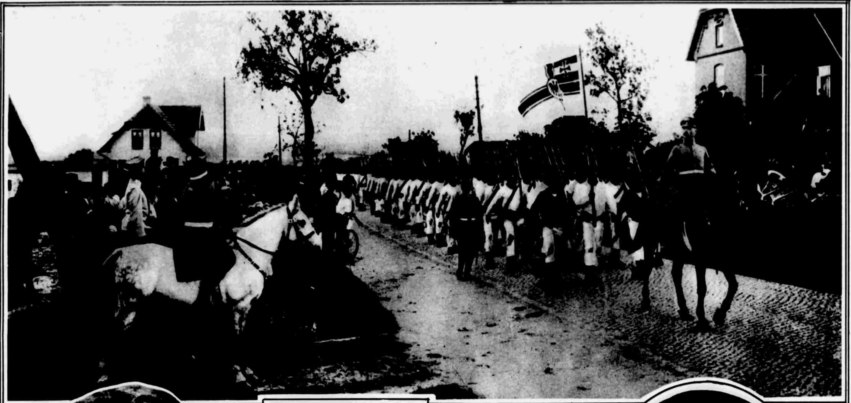
The old spirit still obtains in Germany. A new brigade of marines, being broken, is here shown passing in review before commanding officers. The new German flag is flown.