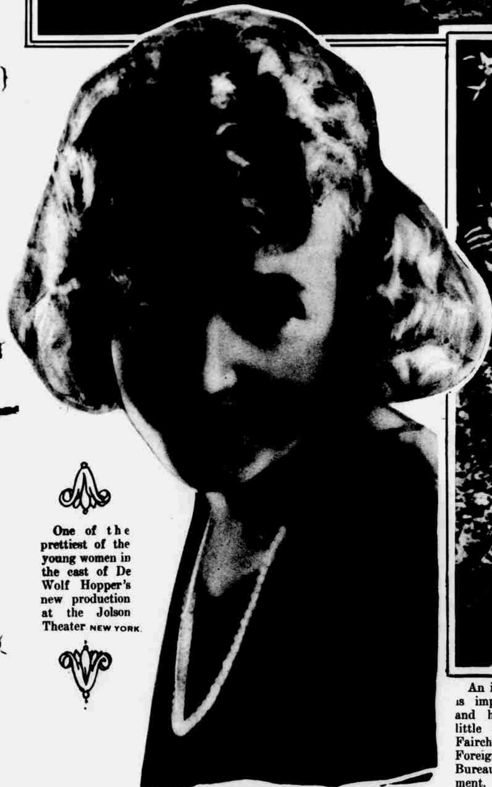
One of the prettiest of the young women in the cast of De Wolf Hopper's new production at the Jolson Theater NEW YORK.