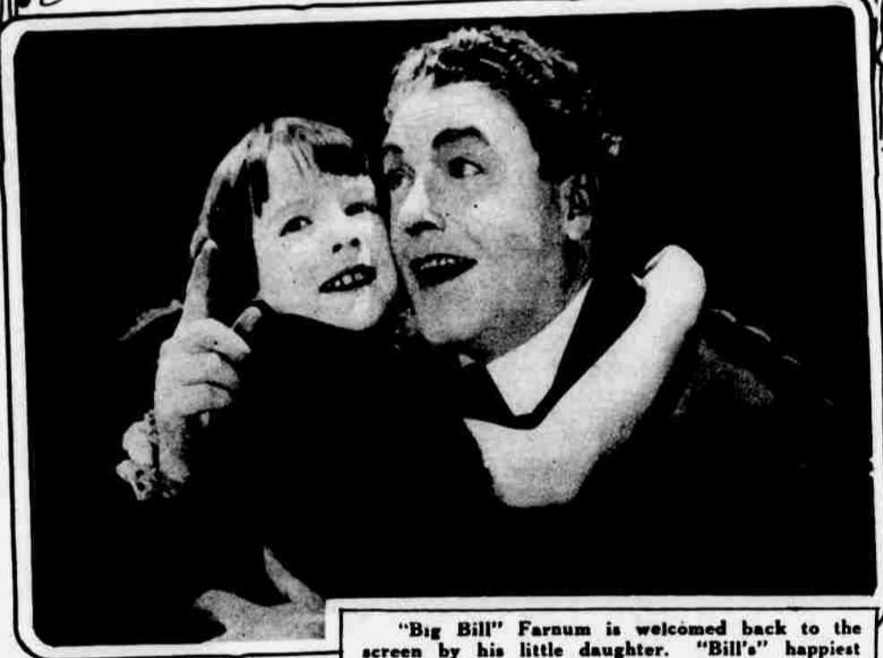
"Big Bill" Farnum is welcomed back to the screen by his little daughter. "Bill's" happiest moments, he says, are spent with the little girl, telling her fairy tales.