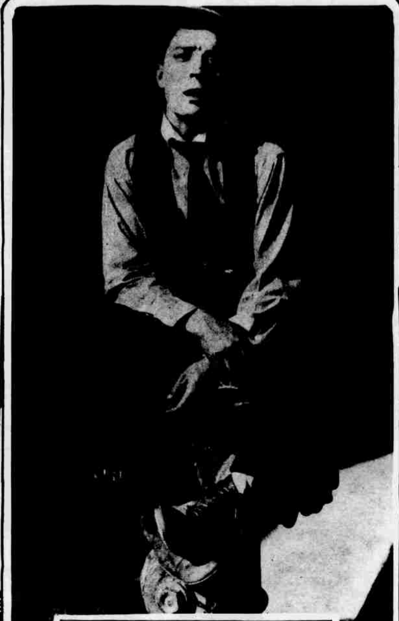
We don't know whether Buster Keaton has just imbibed some TNT or is trying to imitate "The Thinker," but word comes that the scene shows him resting after a chase from cops—in films, of course.