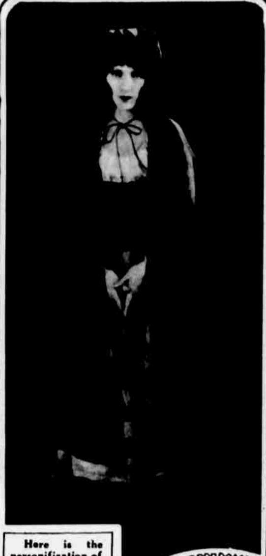
Here is the personification of "My Wild Irish Rose," portrayed by pretty Pauline Starke, a coming cinema luminary.