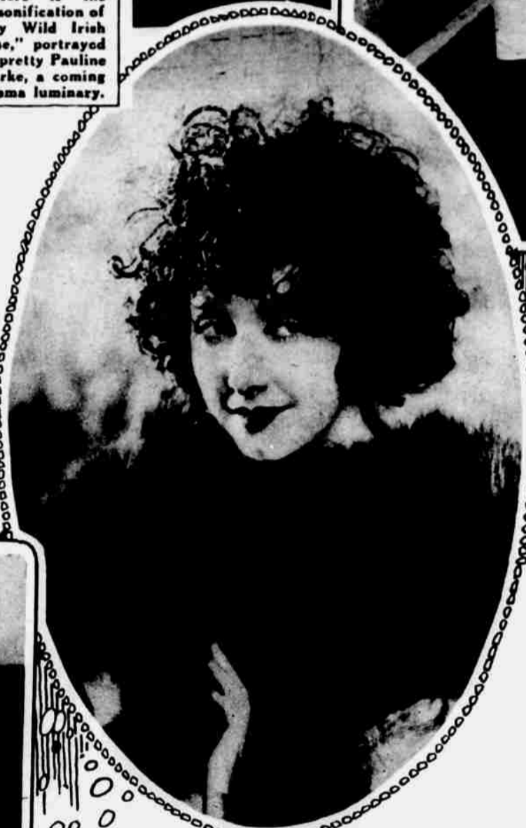
Bobbing up from the fur piece is Mae Busch, a typical snugly-dumpling. Mae plays a leading role in "Foolish Wives."