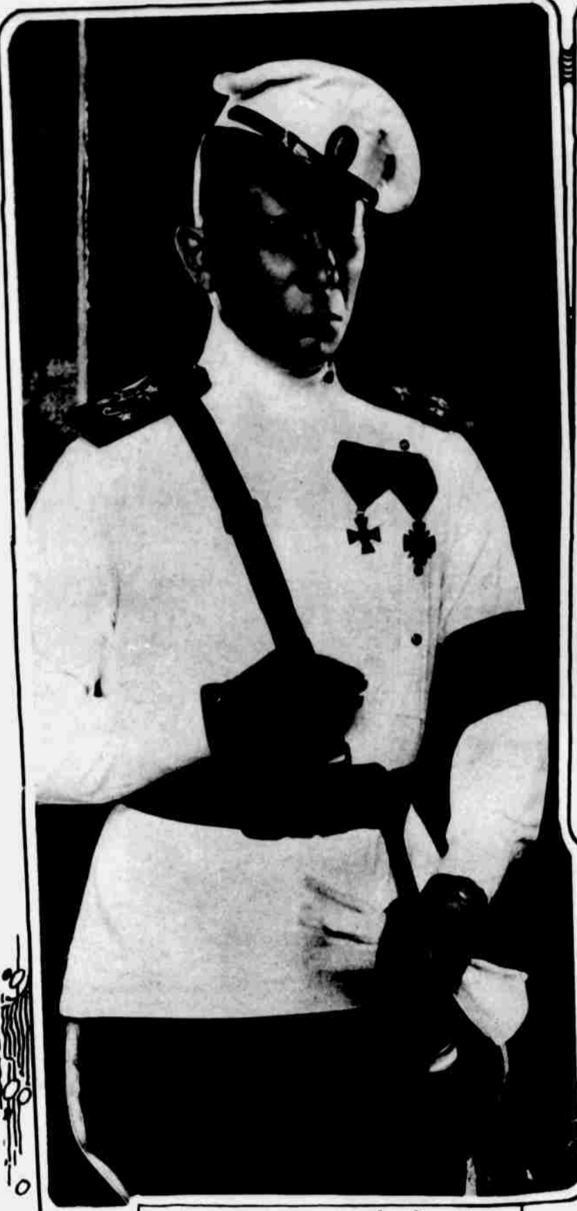
He exerts a mean mien when he captivates the ladies in "Foolish Wives," gigantic film spectacle. In real life he is Count Erich von Stroheim.