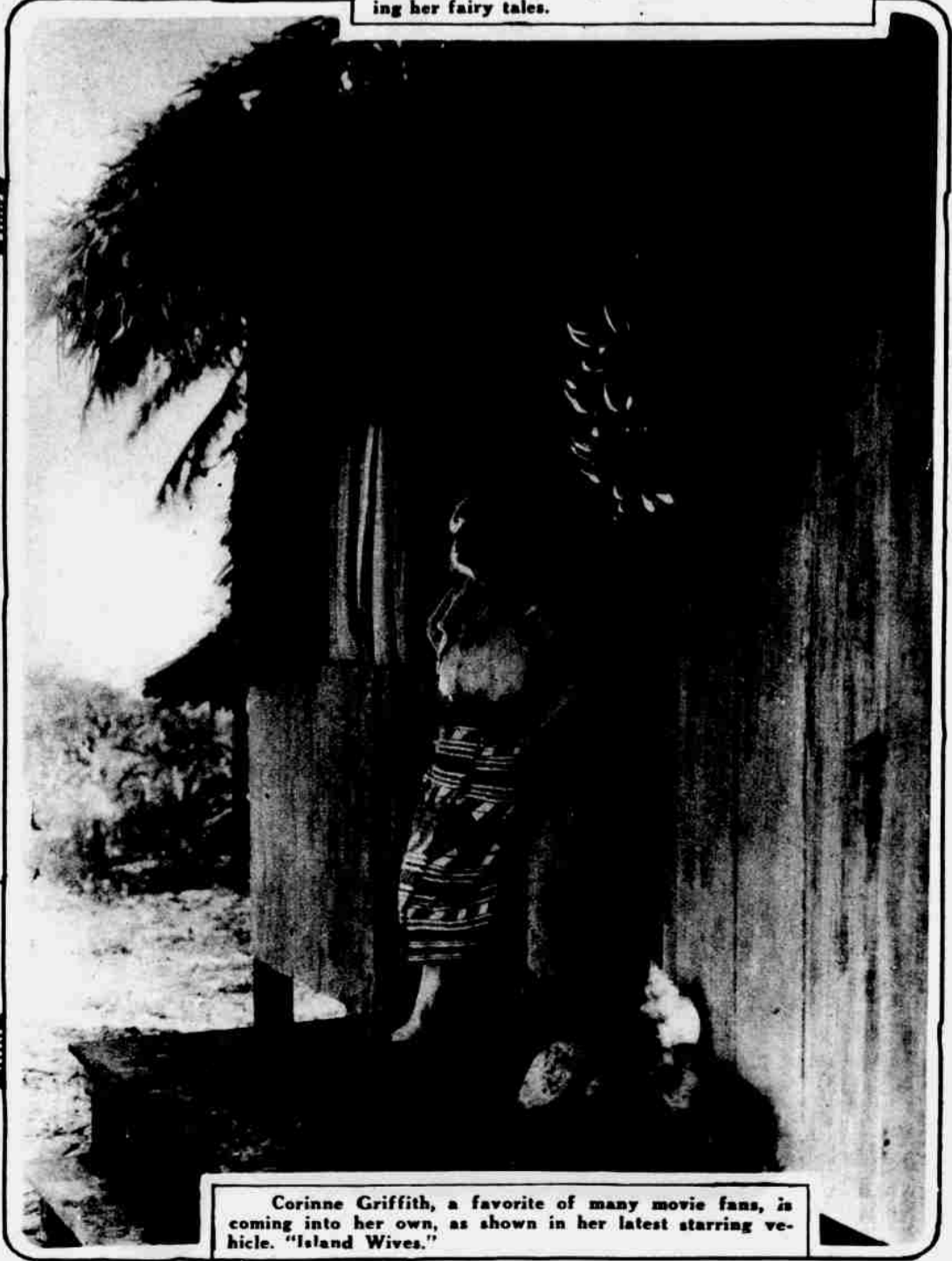
Corinne Griffith, a favorite of many movie fans, is coming into her own, as shown in her latest starring vehicle. "Island Wives."