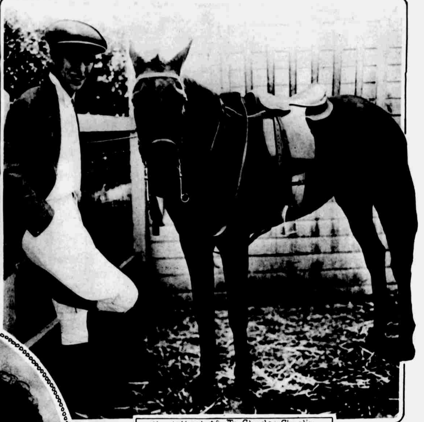
Hoodathunkut? 'Tis Charles Chaplin, the comedy king, on one of his off days.