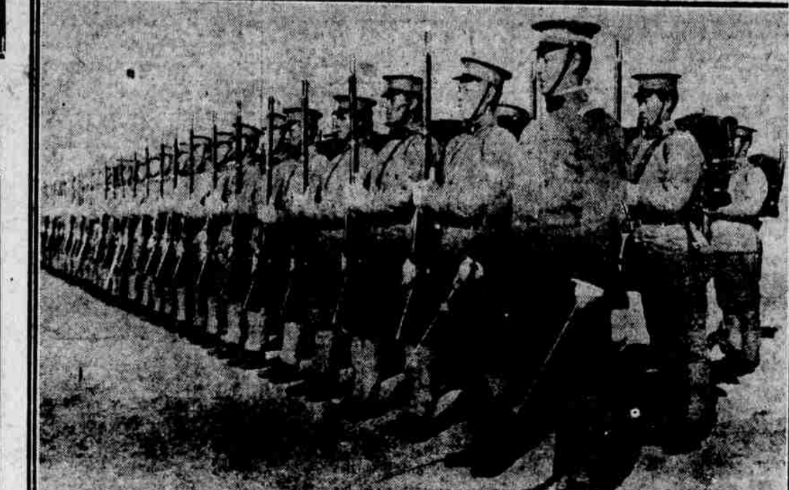
Chinese warriors are no longer poorly drilled soldiers. They are of high type and have modern airplanes and artillery to support them in their wars. The picture shows the type of troops engaged in the fighting this week around Peking.