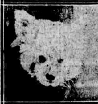
The panda, a member of the raccoon family, lives in the Himalayan mountains, at 12,000 feet. It is the champion of a mountain climber of the world.