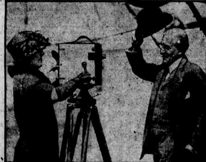
When Julia Marlowe, Shakespearean actress, said "smile" to her husband and co-star, E. H. Sothern, the order, needless to say, was obeyed. Julia and her baby sailed on the Aquitania for Europe for their annual farewell tour.