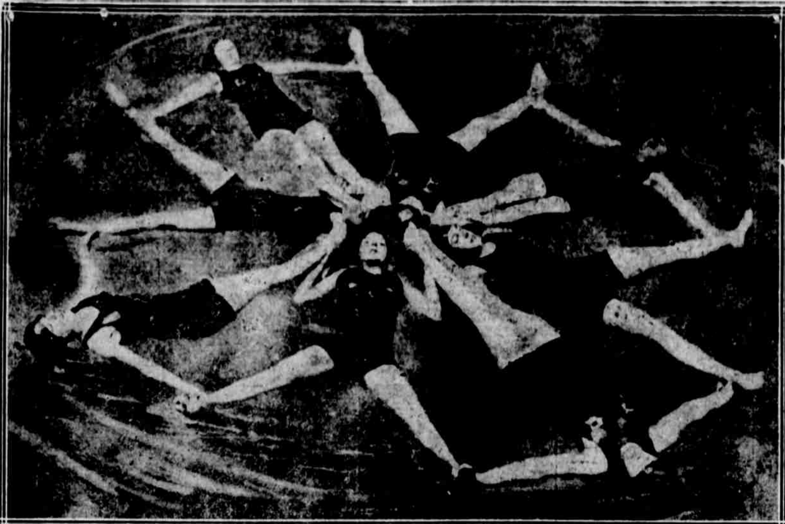
Sights like this may be seen at Omaha swimming pools this summer. Classic swimming poses are the latest stunt of English mermaids. Members of the Beckenham Swimming club have developed a series of tableau-like figures which are worked out while floating in the water. "The Wheel" is pictured here. Other figures can be developed by any number of swimmers. Water fans in this country will take up the idea, it is predicted.