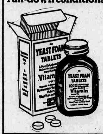
Be sure to ask for this pure yeast by its full name. It is sold by all druggists.

are recommended for loss of appetite indigestion lack of energy under weight pimples · boils nervous troubles run-down conditions