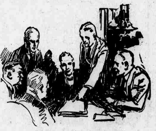
Leading medical scientists of six famous universities and hospitals helped us perfect Yeast Foam Tablets: their tonic properties have been proved