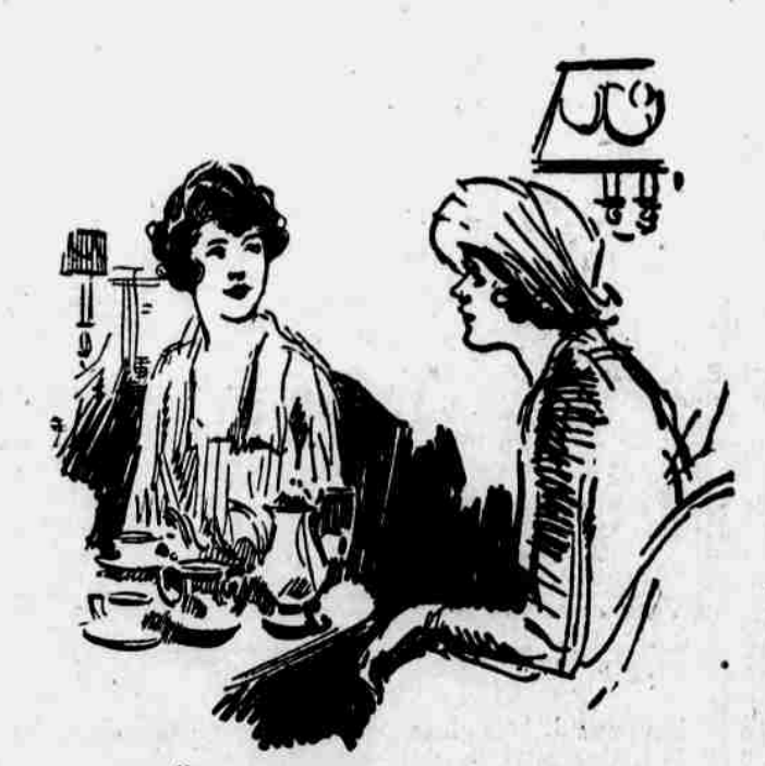
"Oh, that's on account of my new health rule—I'm taking Yeast Foam Tablets!"

Northwestern Yeast Co., Chicago Makers of the famous baking yeasts, Yeast Foam and Magic Yeast