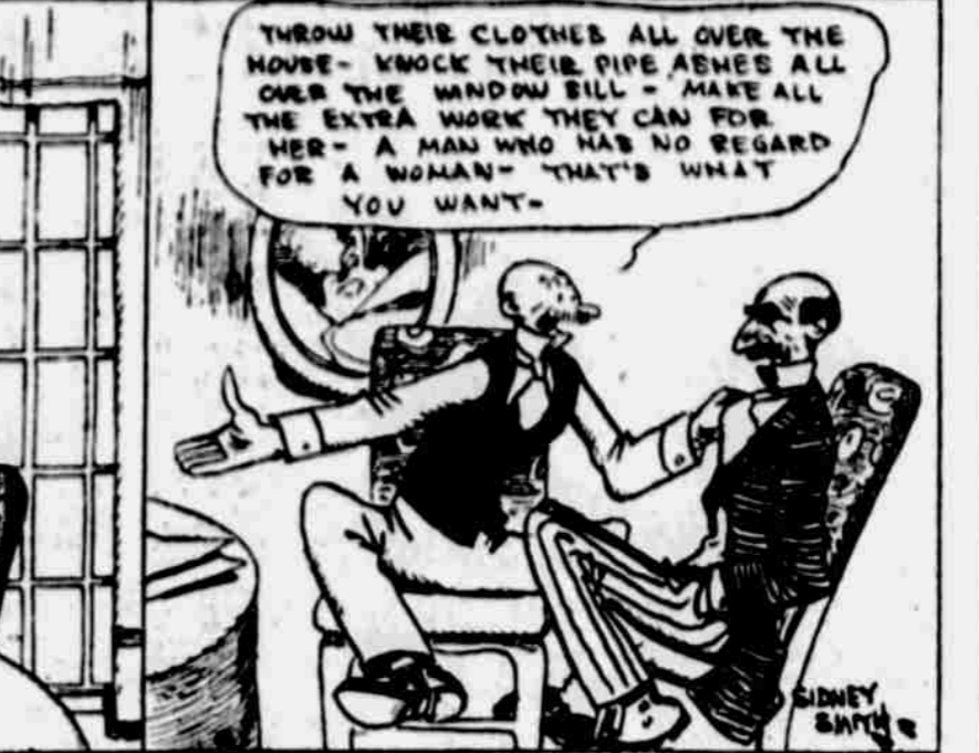
BRINGING UP FATHER