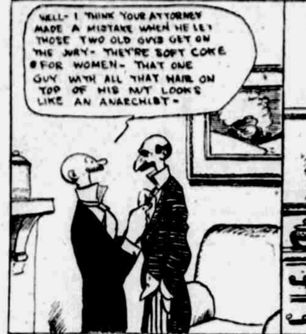
BRINGING UP FATHER