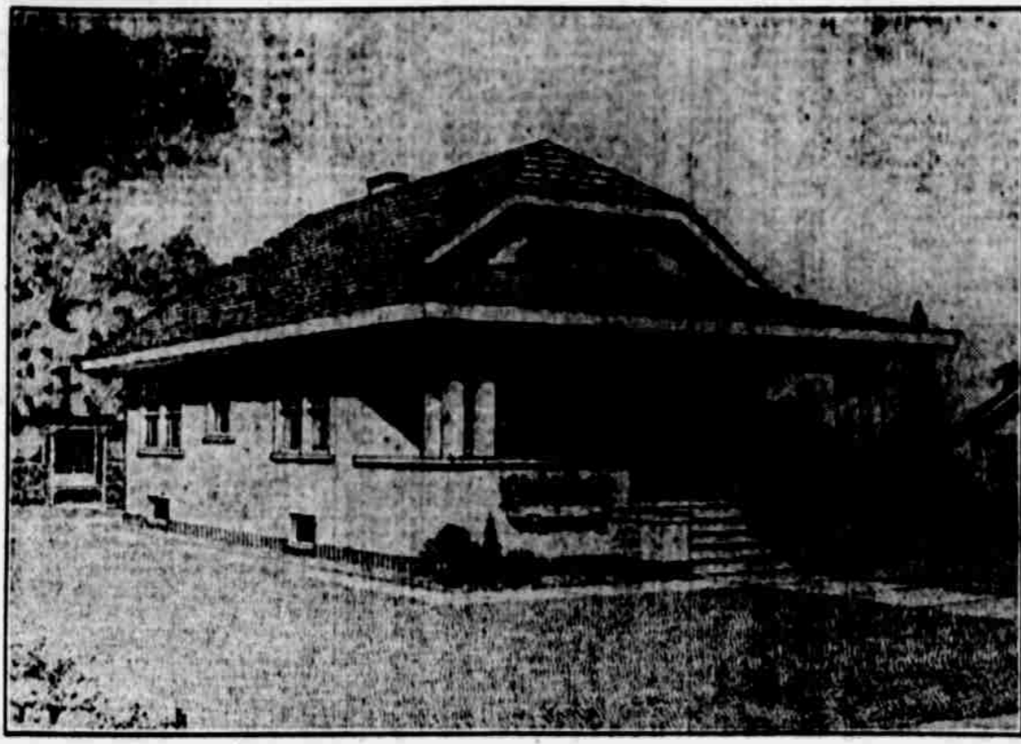
(Copyright, 1921.) No. 1156. —By Adams & Kelly Co.