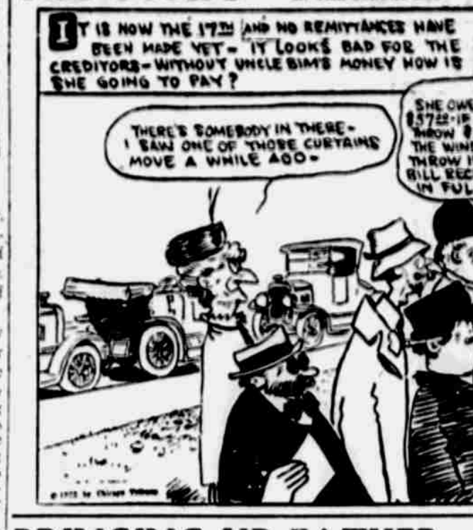
BRINGING UP FATHER - Registered U. S. Patent Office