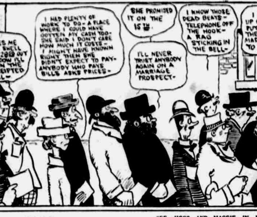
SEE JIGGS AND MAGGIE IN FULL PAGE OF COLORS IN THE SUNDAY BEE