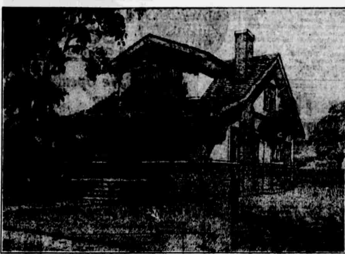
Copyright, 1921. No. 1532. By Adams & Kelly Co.