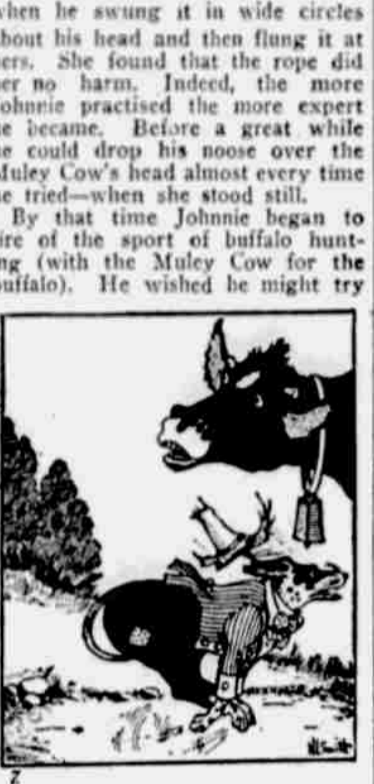
"My goodness!" she bellowed.

lassing her from the back of the old horse Ebenezer. But he hardly thought his father would approve of the plan.