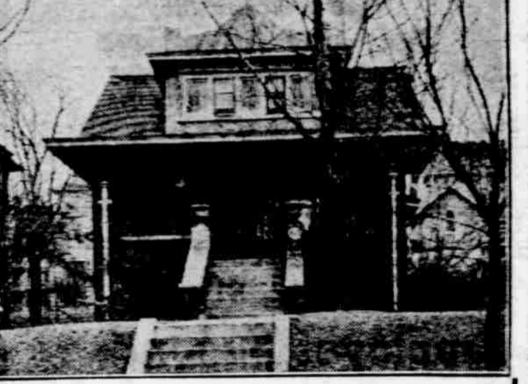
THIS WEST FARNAM HOME of eight rooms. For Sale at a Reasonable Price. Accessible to all Farnam and Dundee cars, Columbian school and several churches.