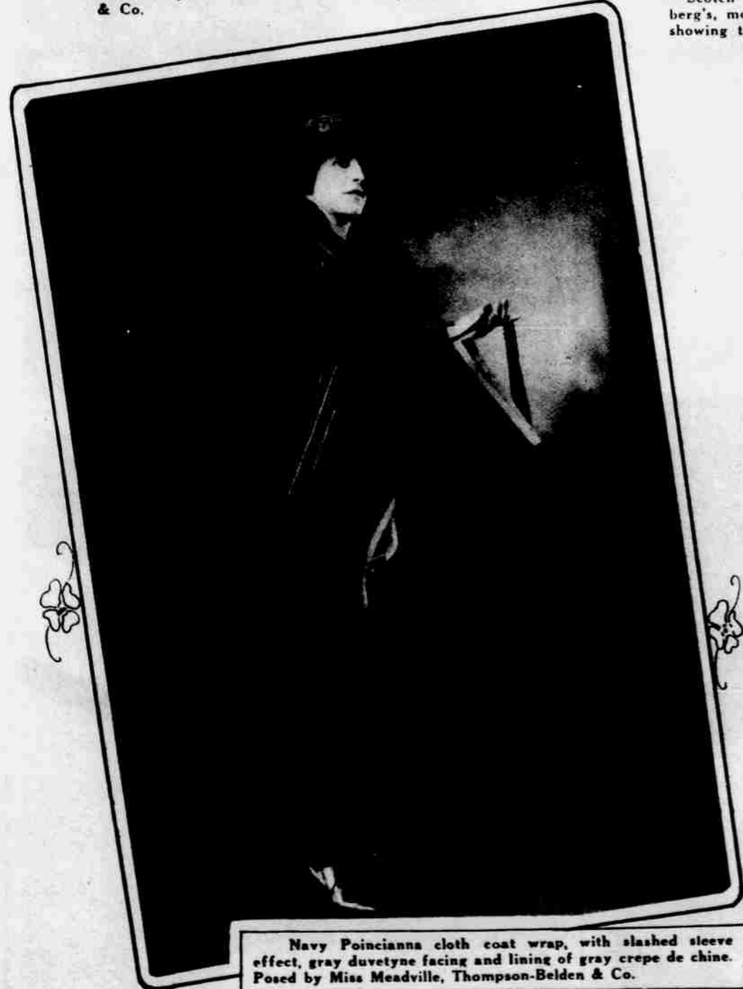
Navy Poincianna cloth coat wrap, with slashed sleeve effect, gray duvetyne facing and lining of gray crepe de chine. Posed by Miss Meadville, Thompson-Belden & Co.