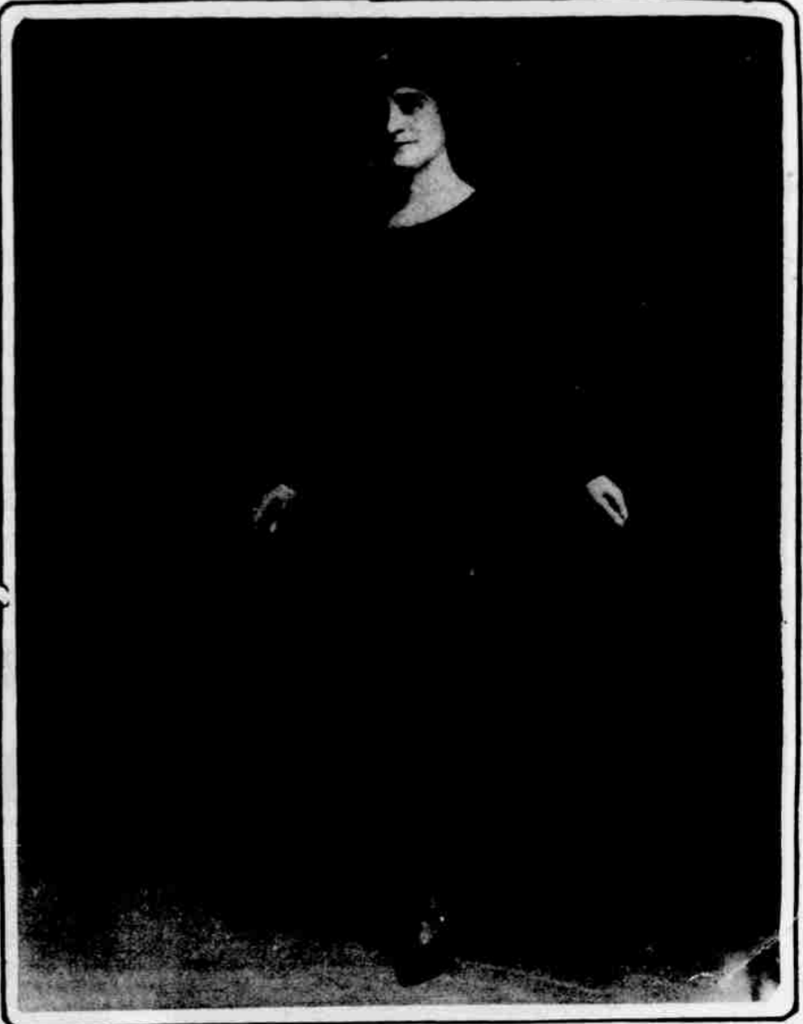
A Betty Wales model of black taffeta, shown by the Eldredge-Reynolds company.