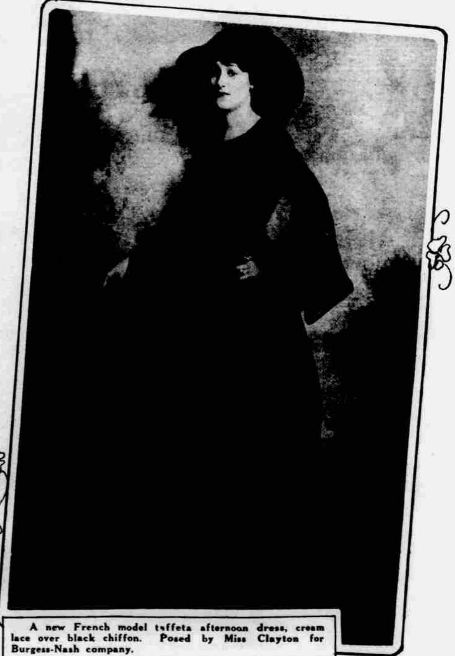
A new French model taffeta afternoon dress, cream lace over black chiffon. Posed by Miss Clayton for Burgess-Nash company.