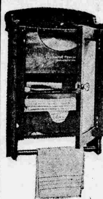
One of Our Cabinets