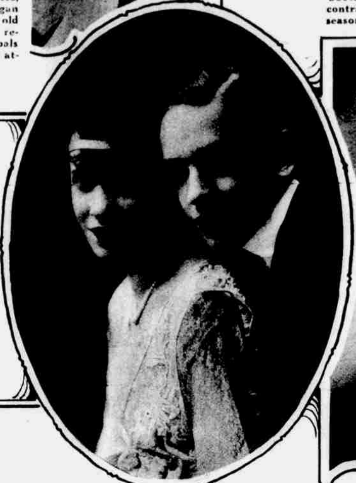
Freddie and Adele Astaire, appearing in a repertoire of songs and dances, were formerly Fred and Adele Austerlitz, of Omaha. They were child prodigies of the stage in their earlier years, and the critics have been giving them credit for improvement each season.