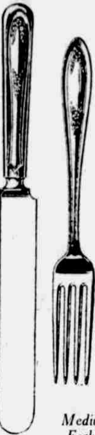
Medium Forks Set of 6: $1.60 Medium Knives Set of 6: $2.40