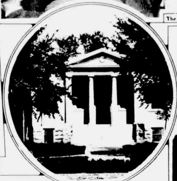
Public library, Albion