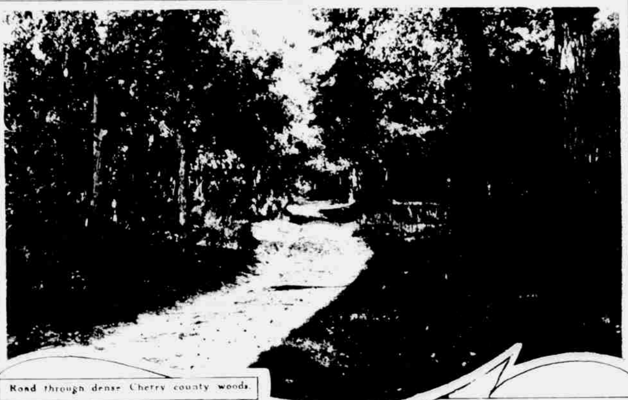
Road through dense Cherry county woods.