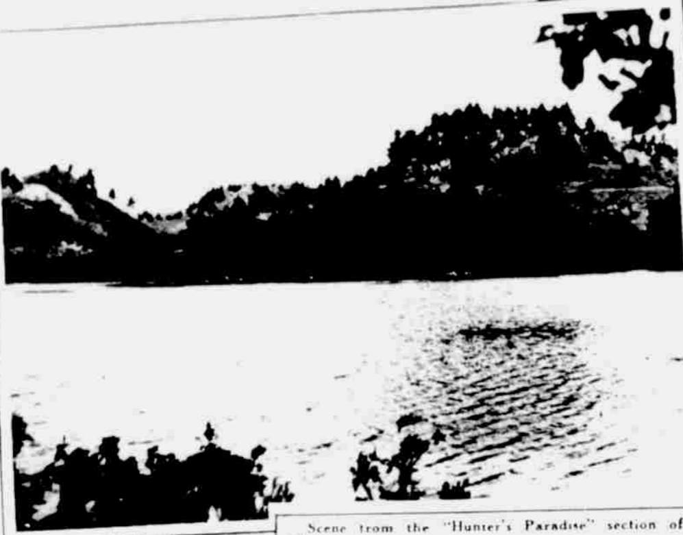
Scene from the "Hunter's Paradise" section of Cherry county