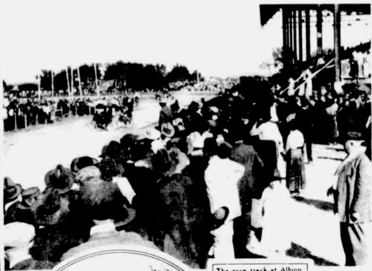
The race track at Albion