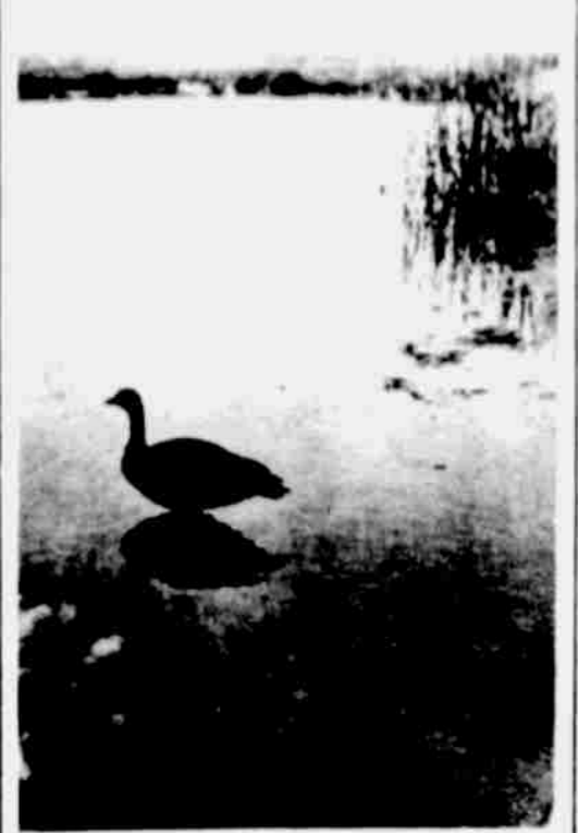
An unusually good snapshot taken in the "duck country" near Valentine.