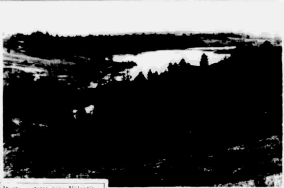
Ducks retreat near Valentine