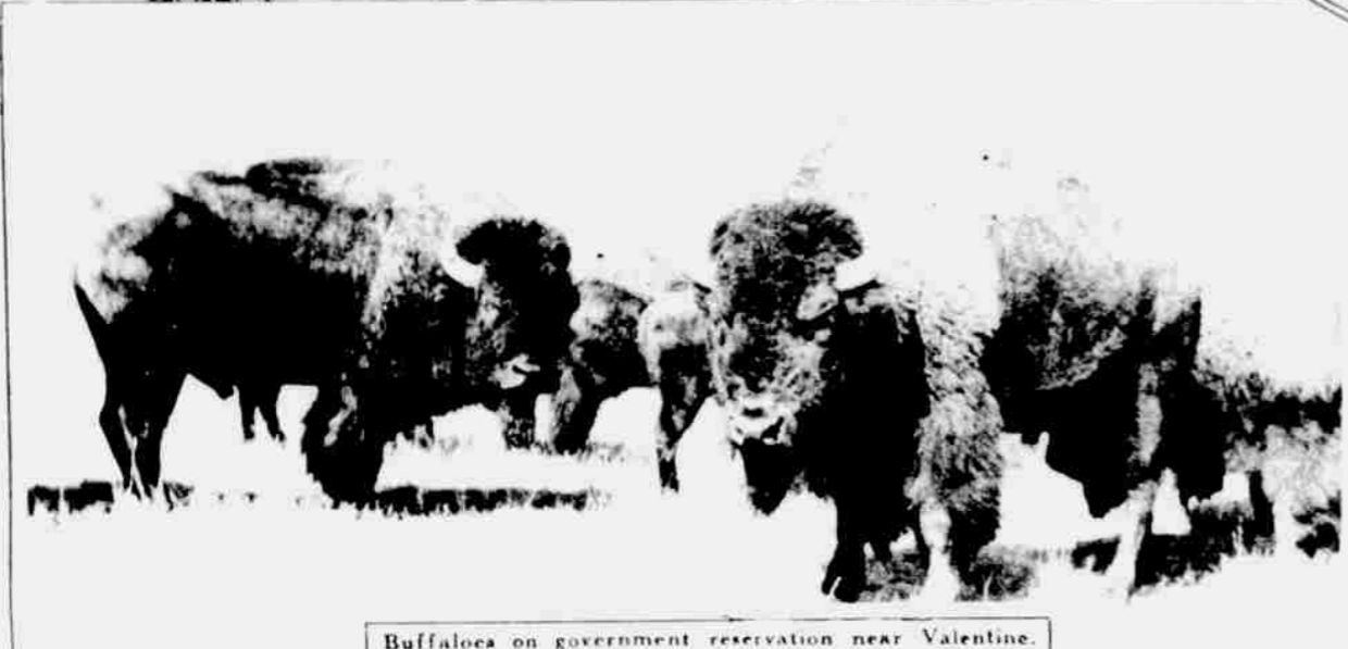
Buffaloes on government reservation near Valentine.