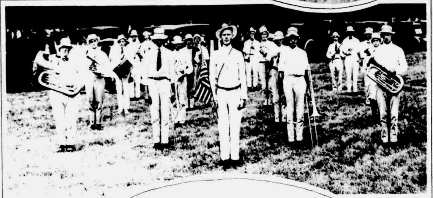
Albion High school band.