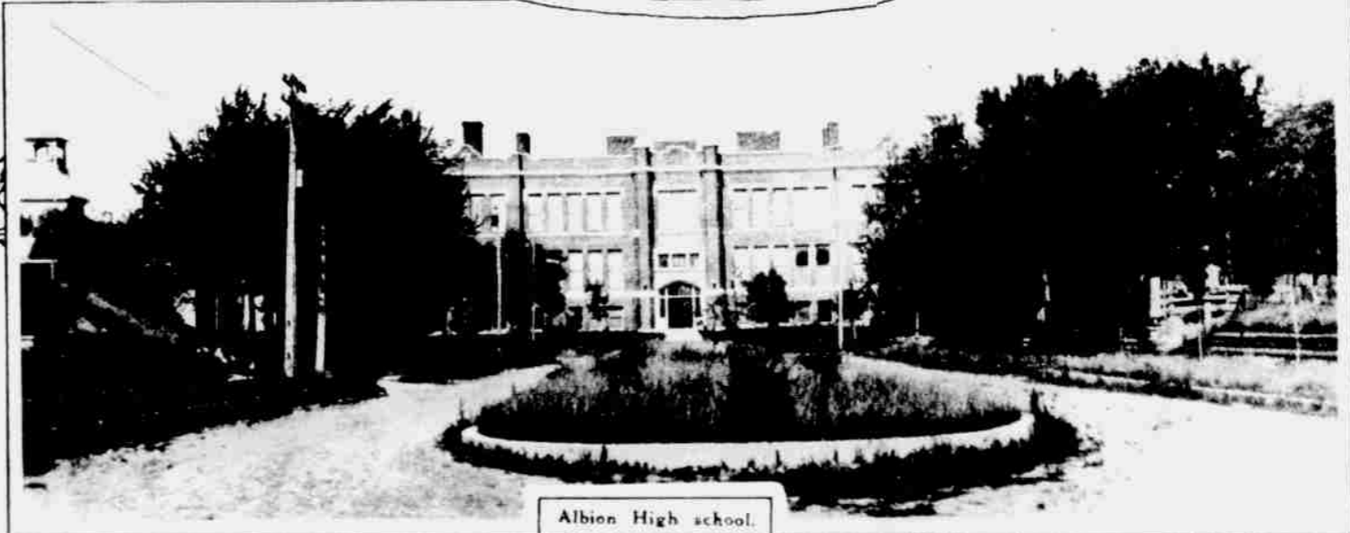
Albion High school.