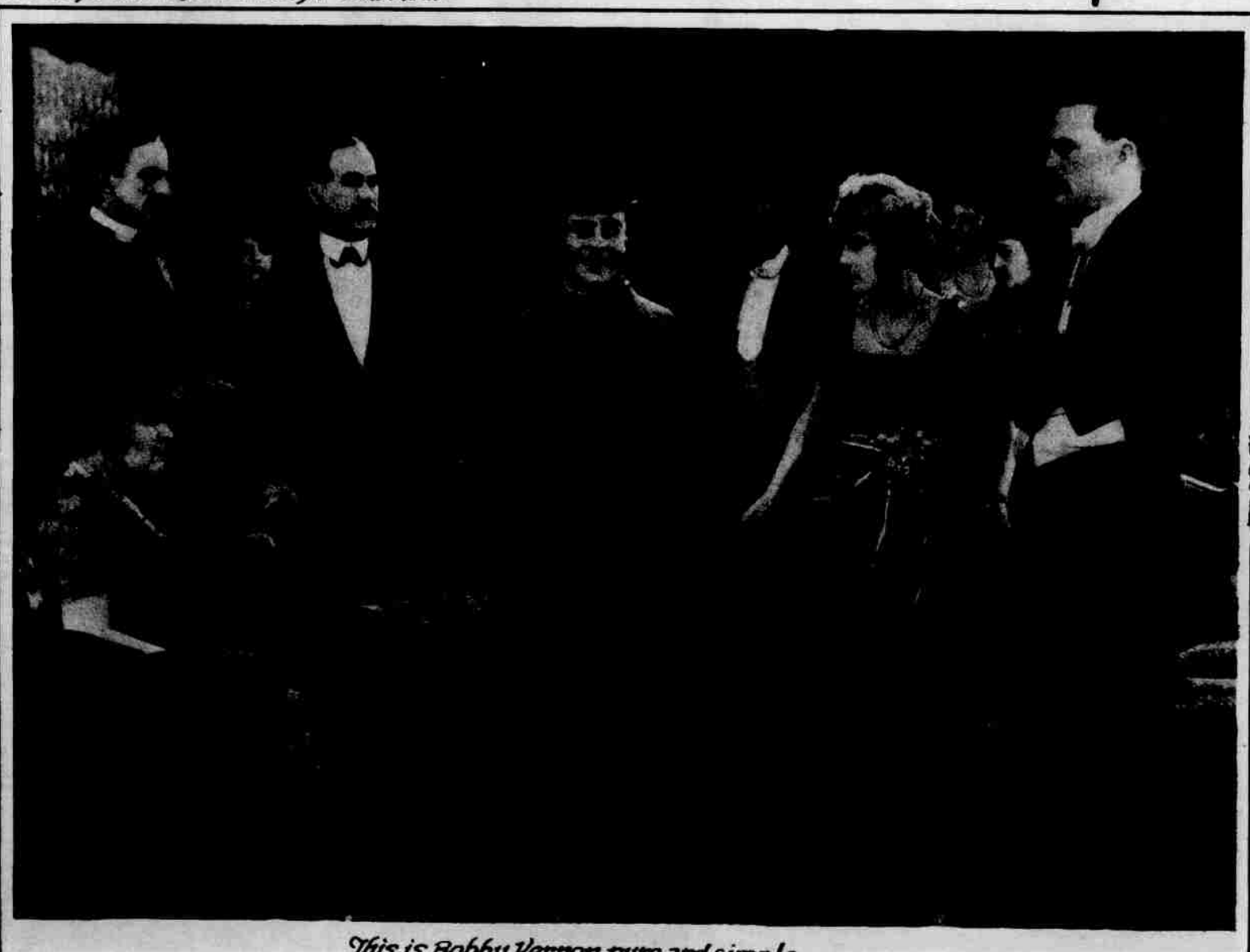
This is Bobby Vernon pure and simple.