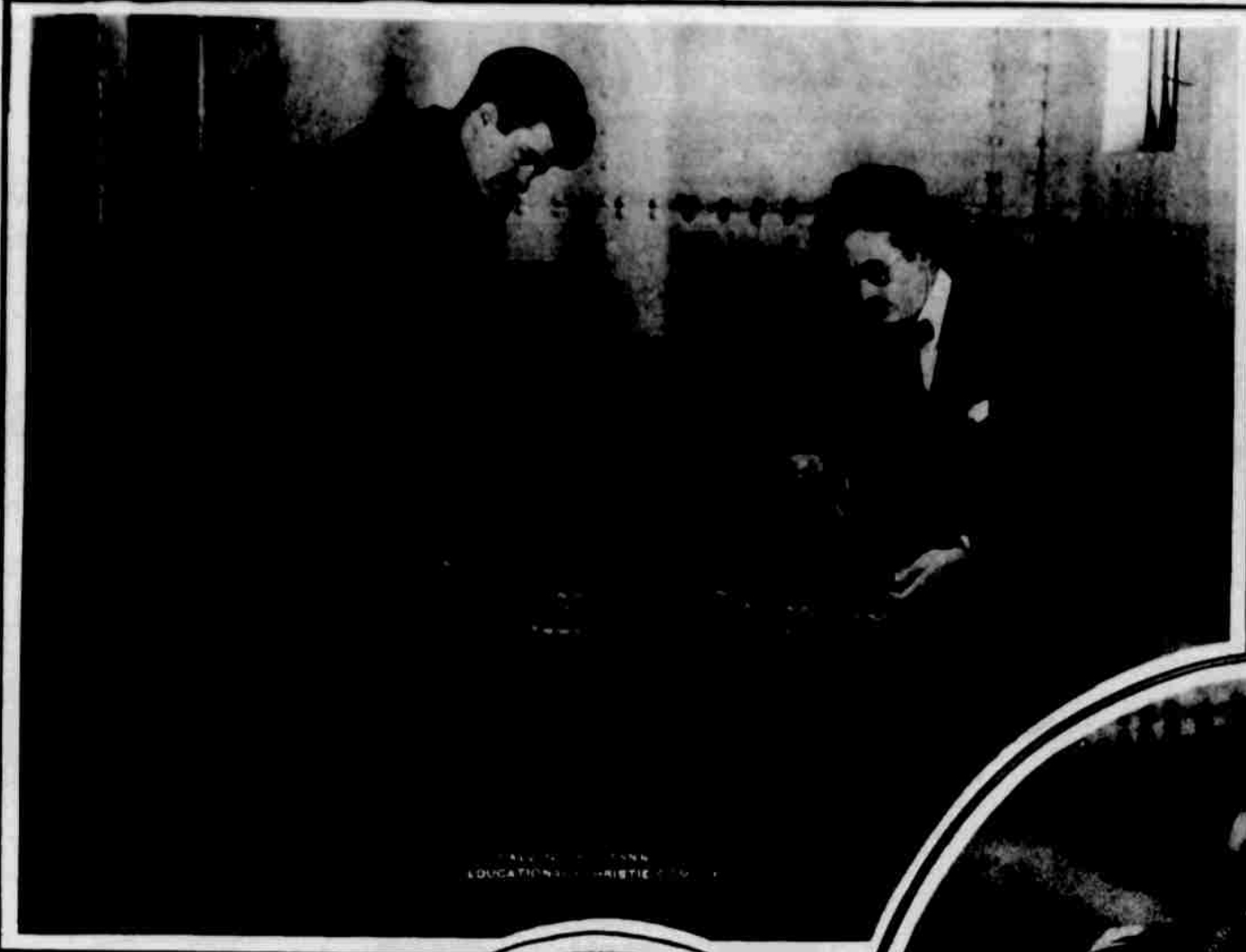
"What's a jail house without a deck?" asks Eddie Barry, slapstick comedian.