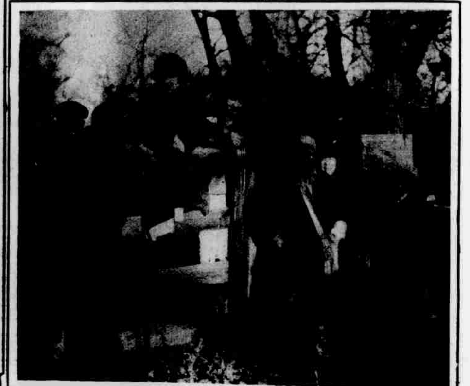
Everybody happy. Ready for the start homeward.