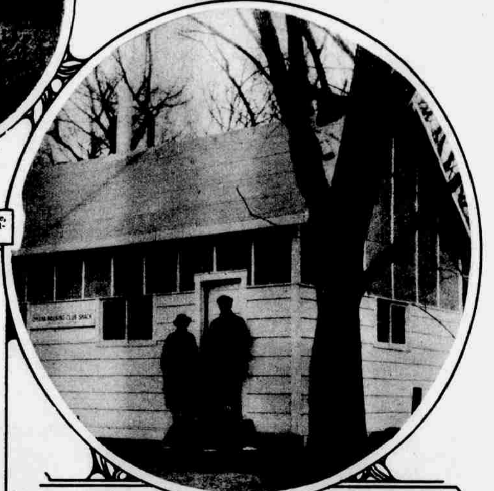
The club shack in Fontenelle forest, south of Omaha.