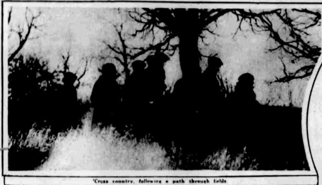
Cross country, following a path through fields.