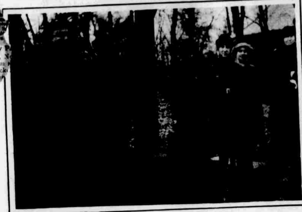
Coffee's ready on the club's private cook stove.