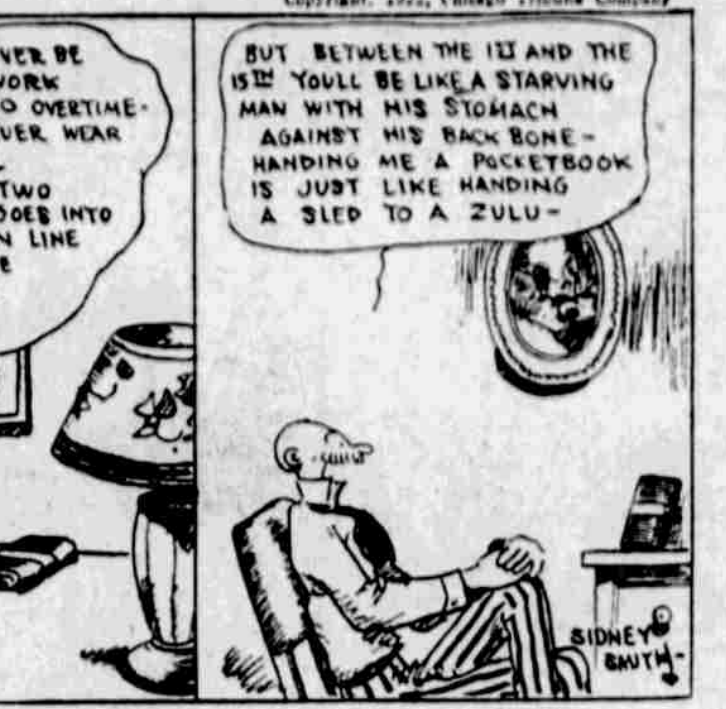
BUT BETWEEN THE 13 AND THE 15 YOU'LL BE LIKE A STARVING MAN WITH HIS STOMACH AGAINST HIS BACK BONE— HANDING ME A POCKETBOOK IS JUST LIKE HANDING A SLED TO A ZULU—