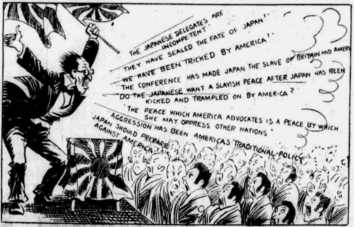
Learn that the Japanese jingoes are violently denouncing the weakness of their own delegates to the conference.