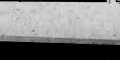
Safe Milk For Infants and Invalids. NO COOKING.

The "Food-Drink" for All Ages. Quick Lunch at Home, Office, and Fountains. Ask for HORLICK'S. Avoid Imitations and Substitutes.