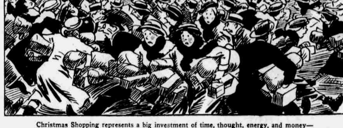
BUT JUST THINK OF THE DIVIDENDS!