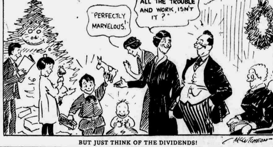
IT'S WORTH ALL THE TROUBLE AND WORK, ISN'T IT? PERFECTLY MARVELOUS.