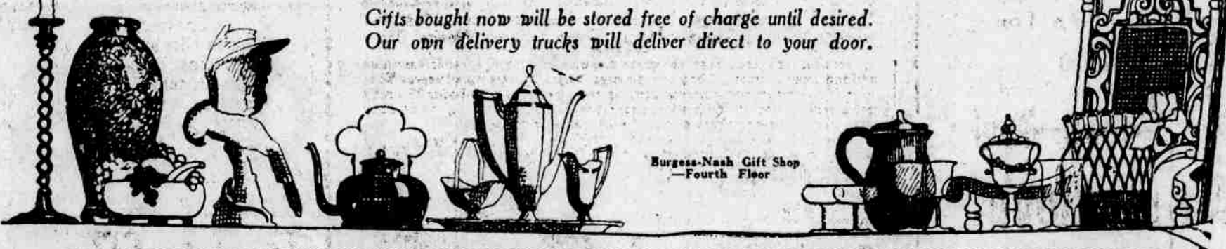
Burgess-Nash Gift Shop—Fourth Floor

Gifts bought now will be stored free of charge until desired. Our own delivery trucks will deliver direct to your door.