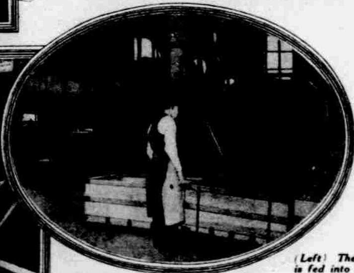
(Left) The shredded tobacco is fed into a cylindrical dryer where the flavor is "set" by high temperature. A second cylinder removes excessive heat and moisture.