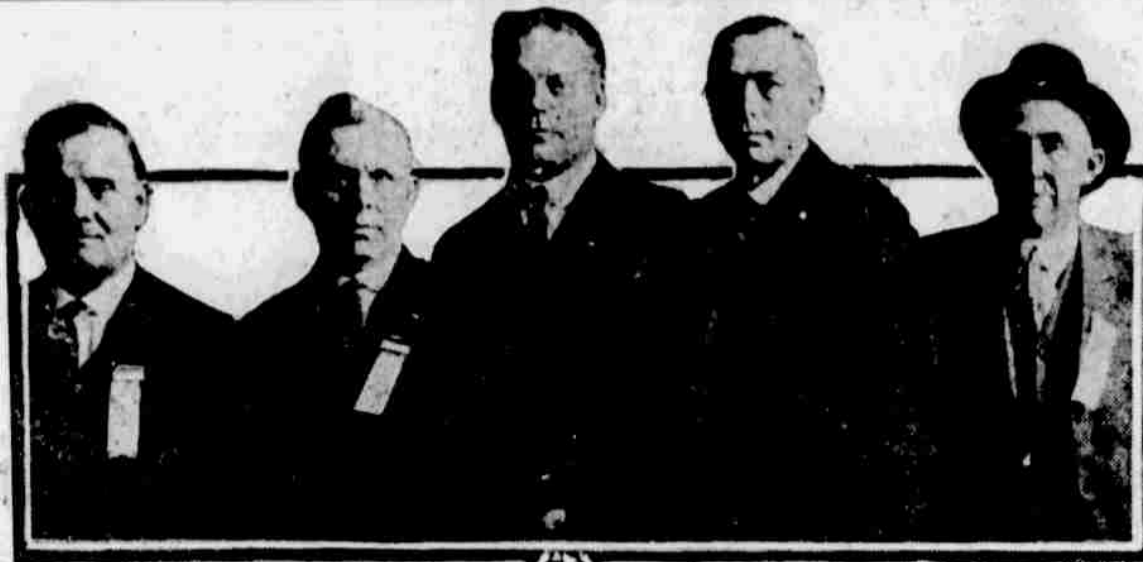
These are officers elected during the convention of the Nebraska Association of Commissioners, Supervisors, Highway Commissioners and County Clerks, which concluded at the Castle hotel Thursday.