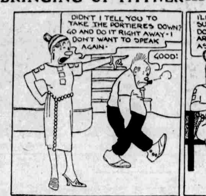
THE GUMPS---SEE IT IN COLORS IN THE SUNDAY BEE