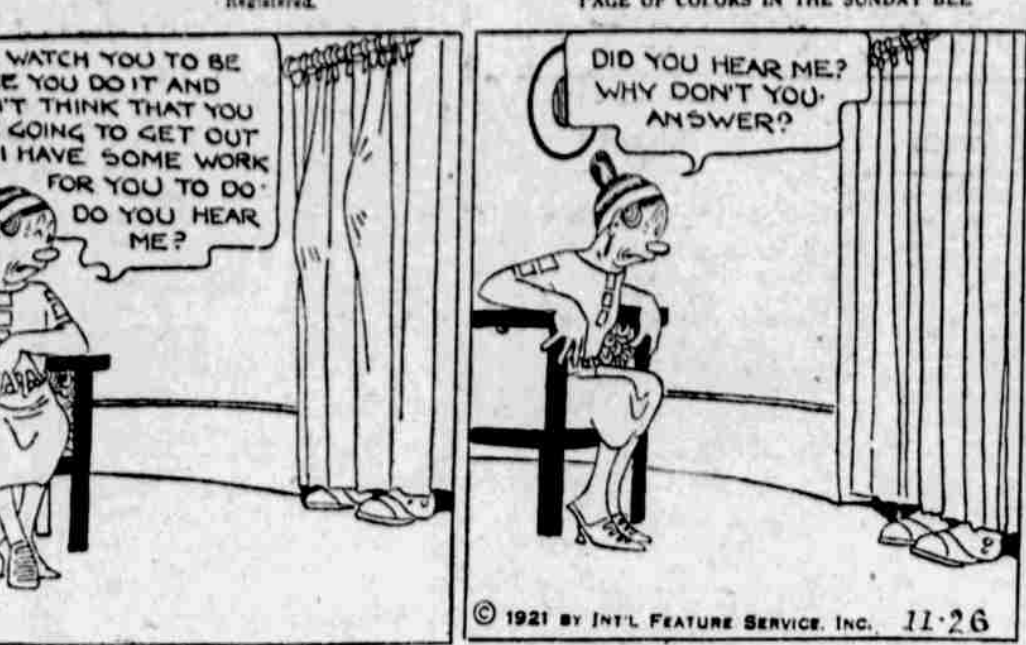
TOO MUCH YEAST