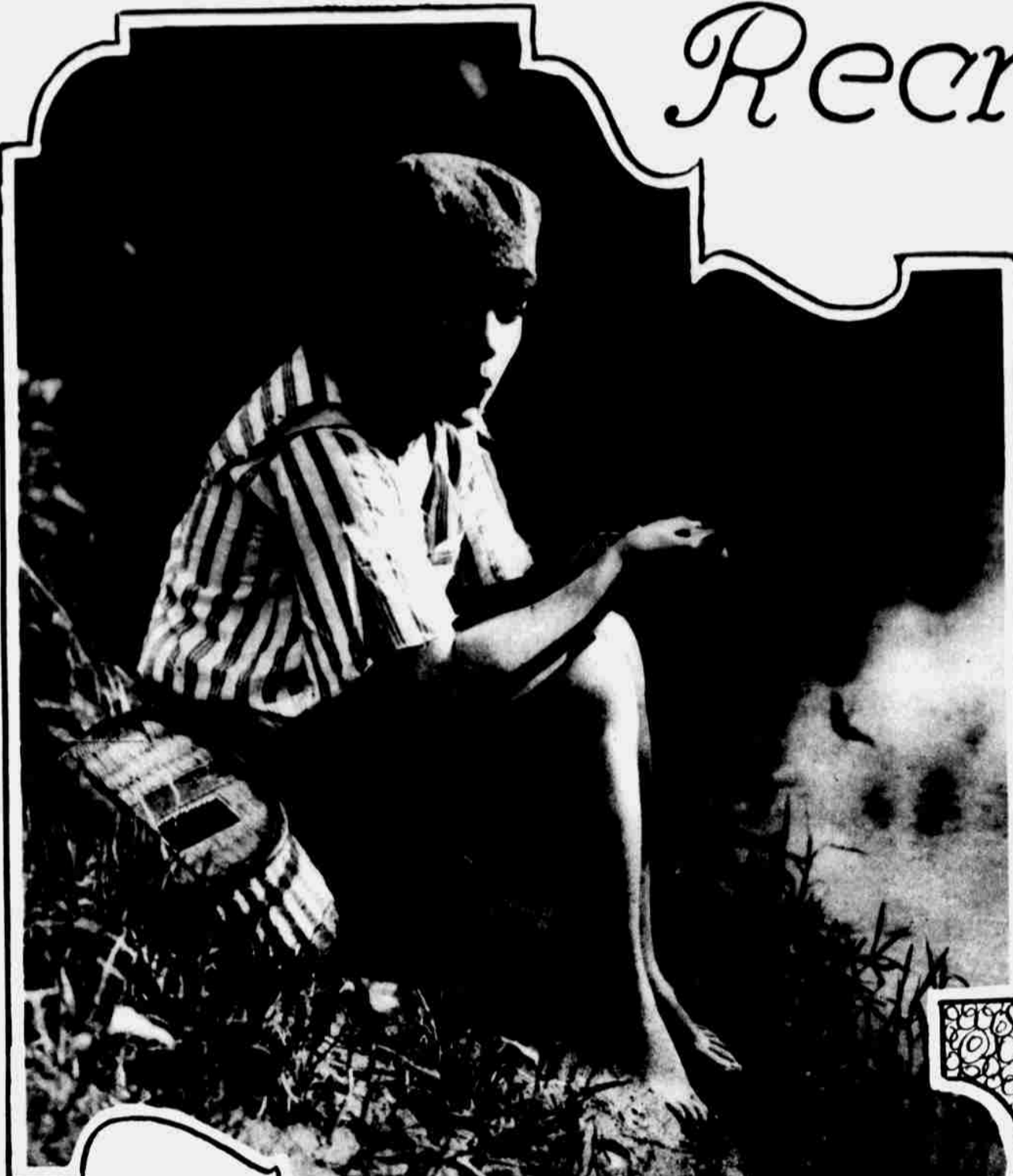
Who said Marie Prevost was through with bare- legs?