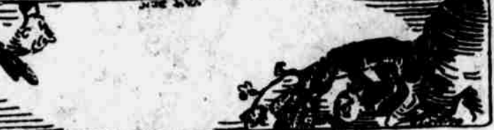
Train Hits Motor Car En Route to Foot Ball Game In Illinois—One Hurt.