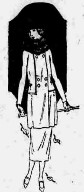
The Downstairs Store

Most of these hats are those soft rolling or crushable velvet hats so becoming to most types; in black and colors.