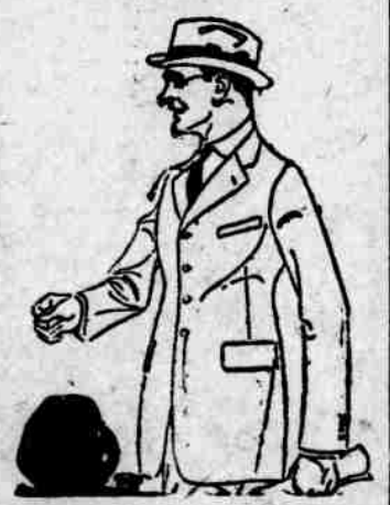
The Downstairs Store

This special group featured for Saturday offers a delightful assortment of both straightlines and fitted effects in serge, tricotine, satin, crepe de chine dresses; other dresses priced from $10.00 to $39.50.