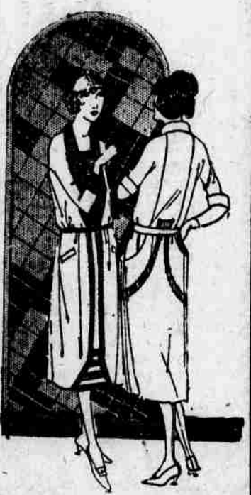
The Downstairs Store