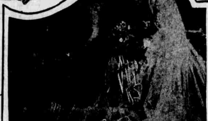
Bride of the Week