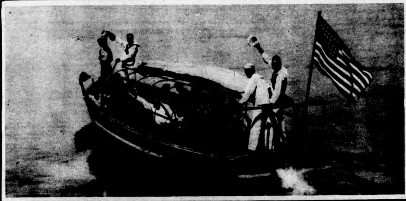
They're off for a cruise up the Big Muddy—in a motor sailer