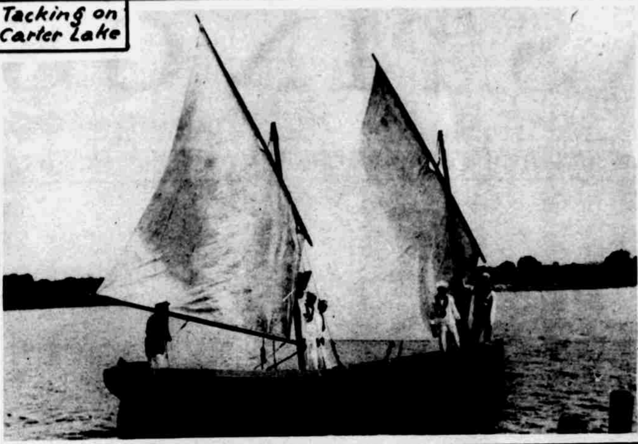
Tacking on Carter Lake