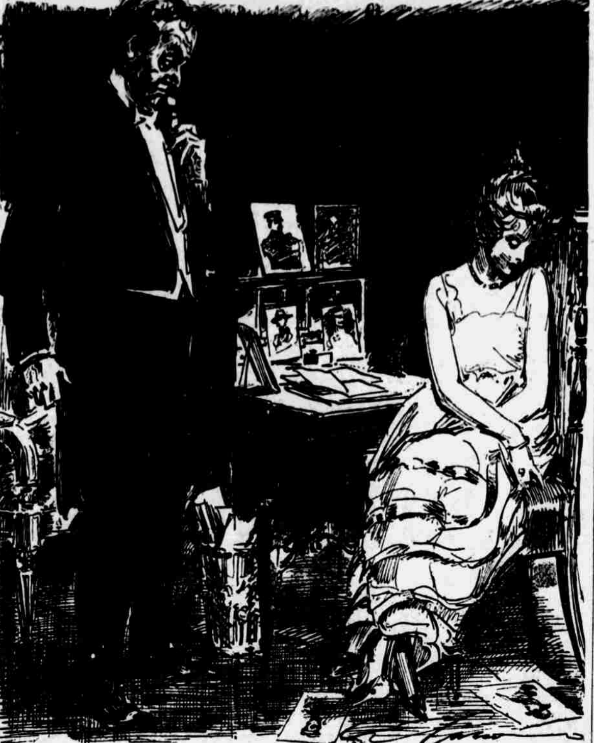
"What, My Dear! Engaged to Another! Don't You Ever Get Tired?" "But, Father, They Need the Change as Much as I Do."

By CHARLES DANA GIBSON. Copyright, Life Publishing Co.