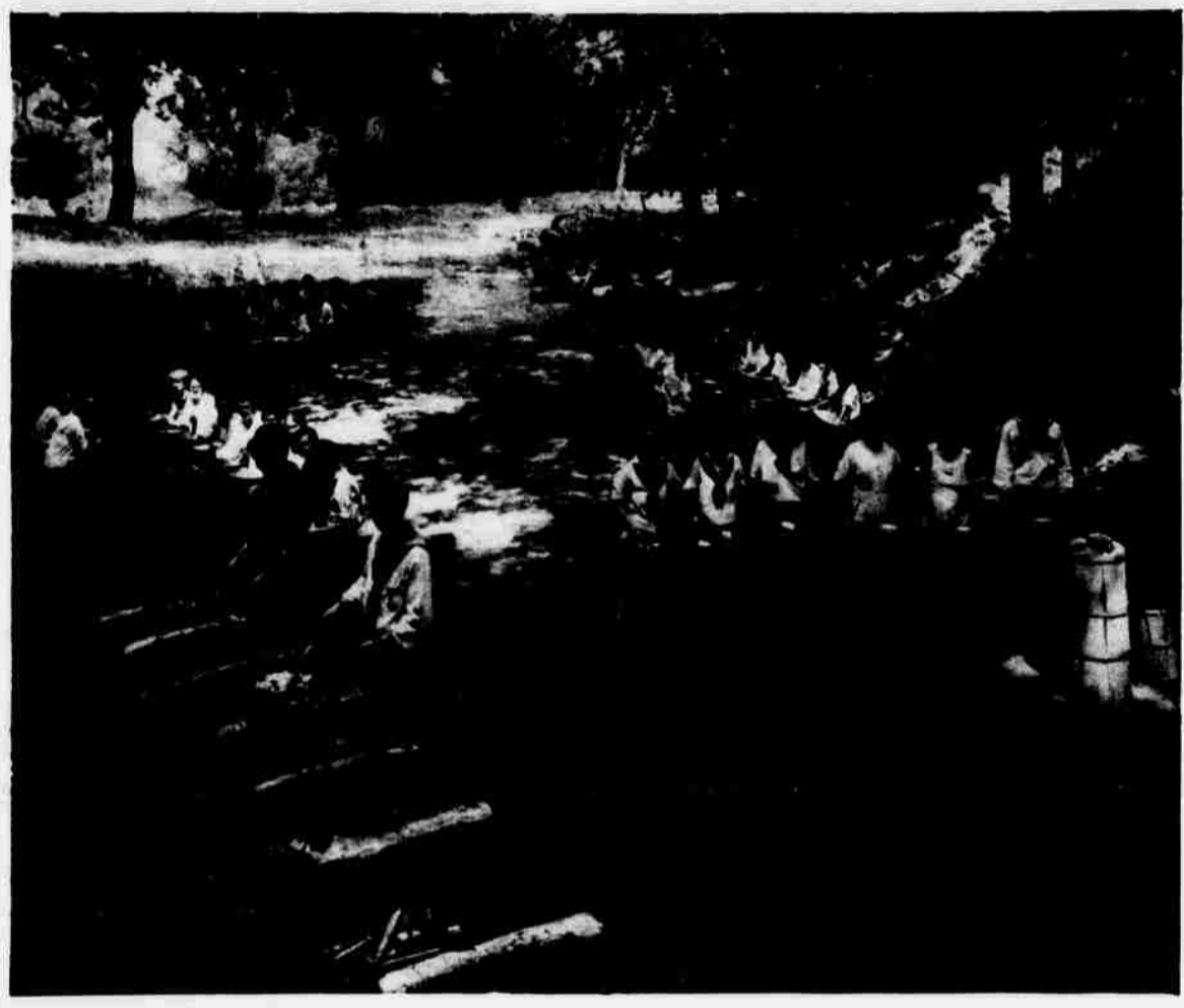
Out door ranges and dining tables.