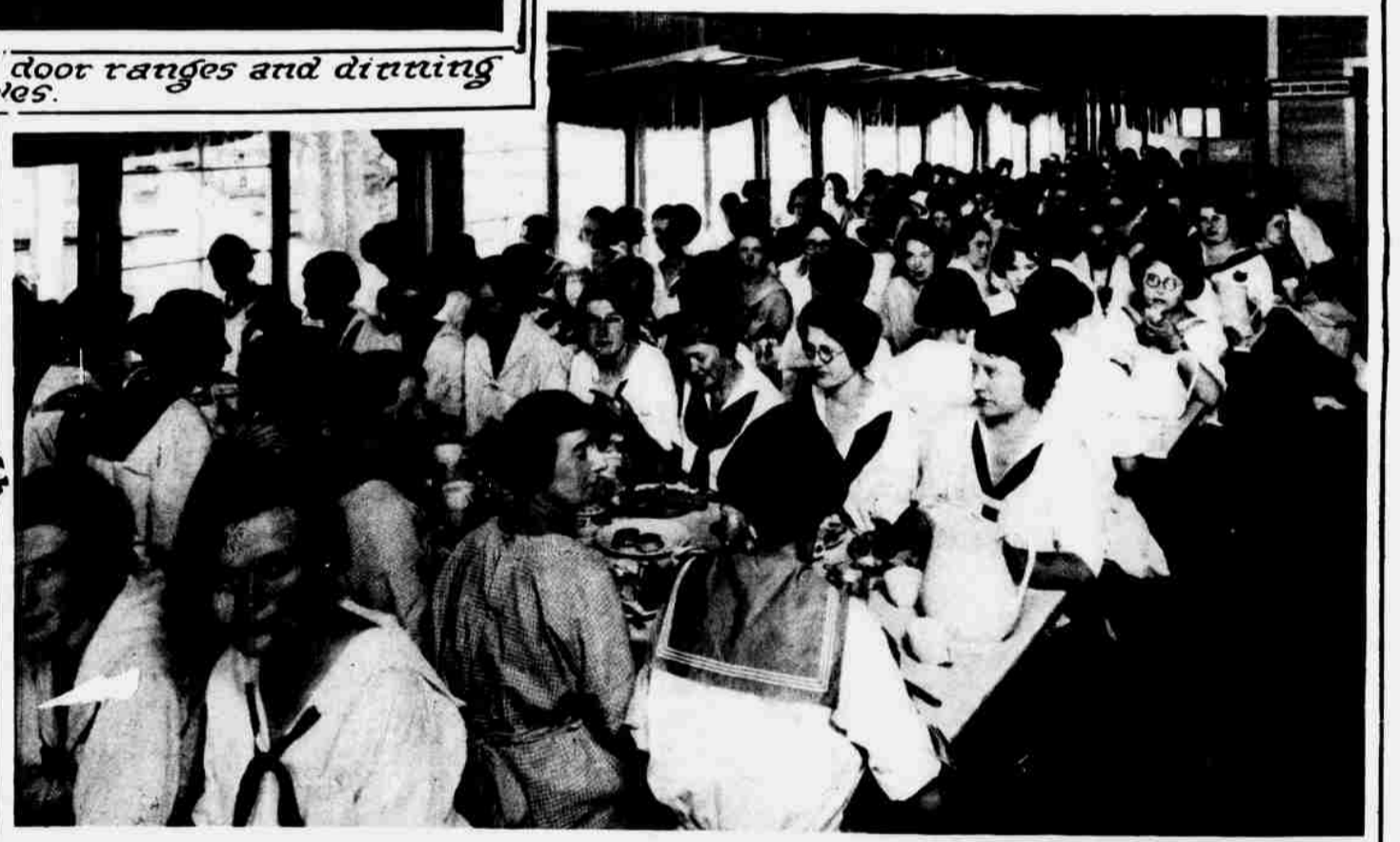
Chow time. Every camper does her share in preparing and serving meals. Carry back your dishes, wash a sign on the walls of the mess hall.