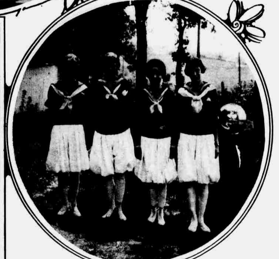
A quartet in regulation camp uniform. The smiles express their verdict on Brewster hospitality.