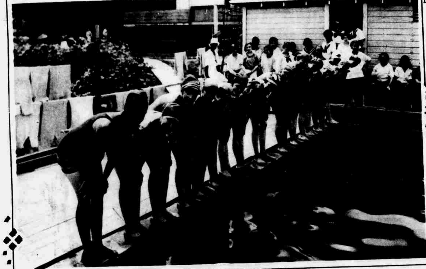
Swimming class ready for a plunge in the big camp pool.