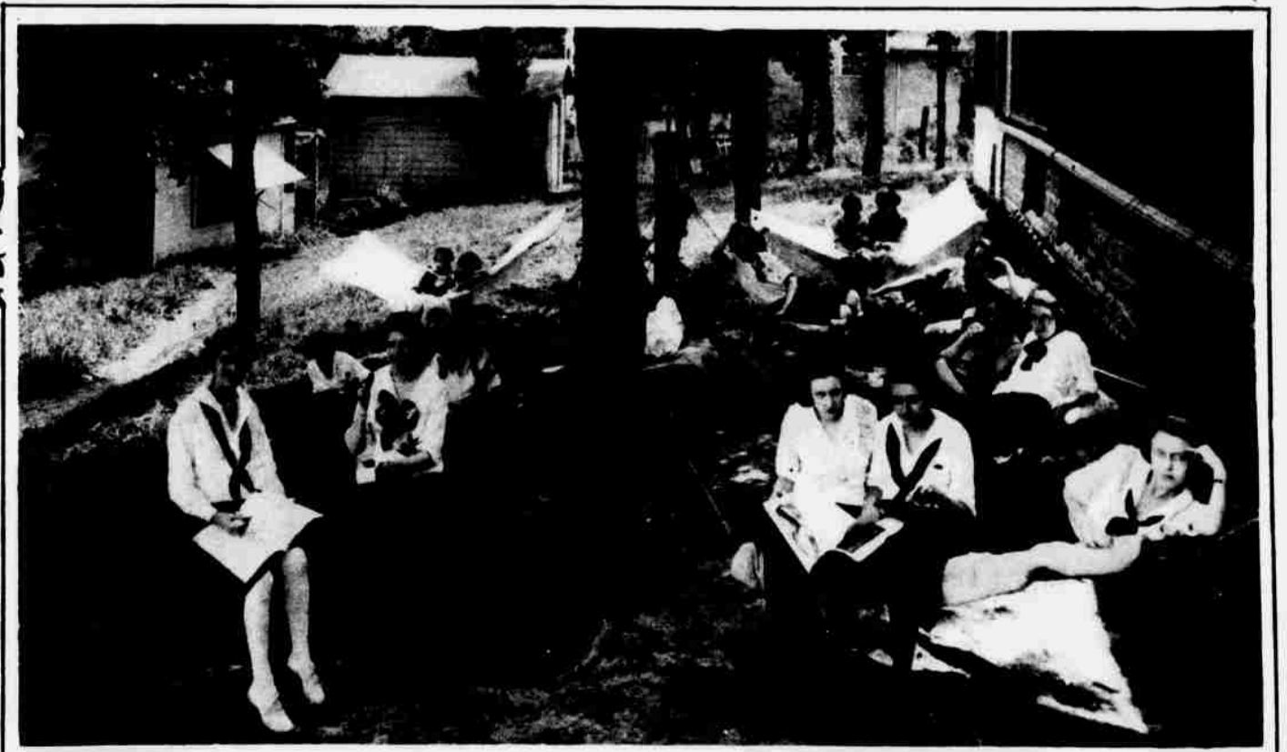
A hammock squad, while away lazy summer hours with magazines, candy and making a bit of gossip now and then.