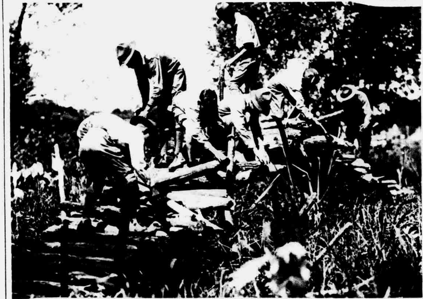
Pioneering Squad building a bridge without nails or ropes. The boys use only the material found in the woods