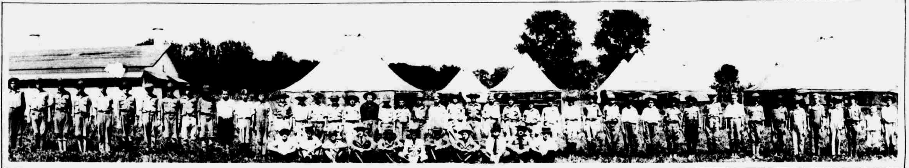
Omaha Boy Scouts in front of their camp, on the Missouri, seven miles south of Omaha. The mess hall and hospital, library and sleeping tents are shown in the background.