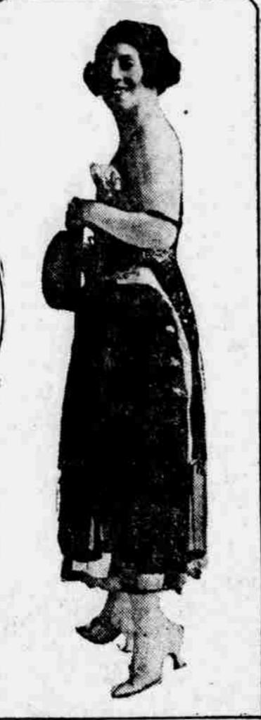
Blossom Seeley (ORPHEUM)