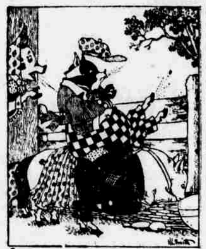
"You're all greedy," Mrs. Pig retorted.