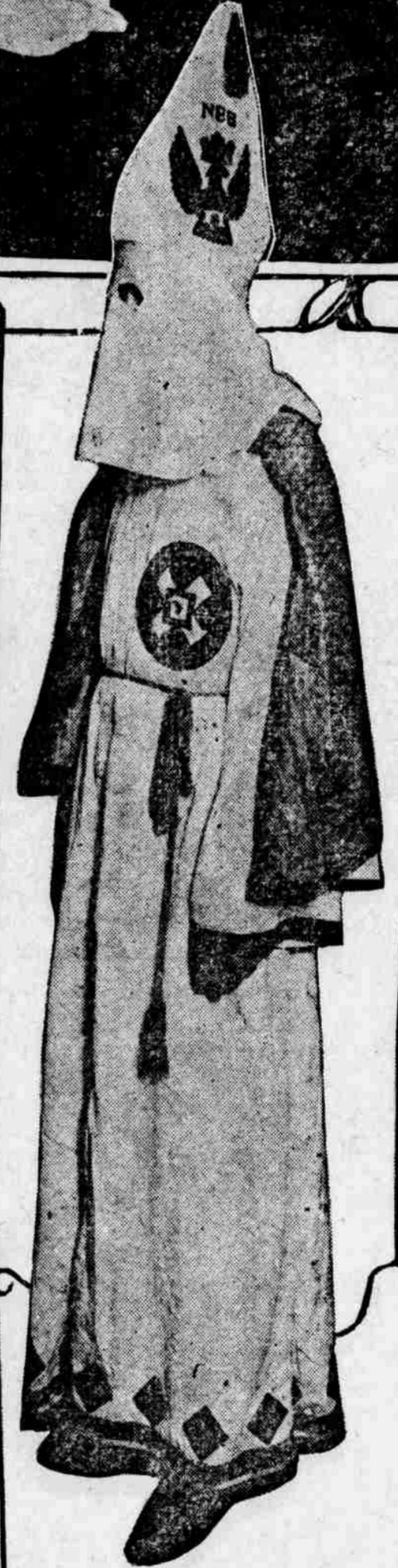
These photographs, which appear exclusively in The Bee, were taken Friday at Lincoln where the first initiation ceremony of the Ku Klux Klan in Nebraska was held.