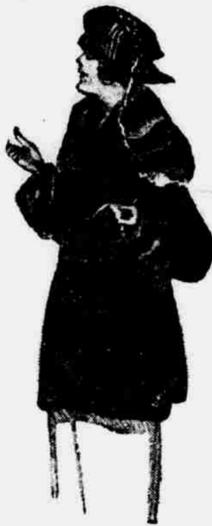
Muskkrat Coat—36-inch length; large shawl collar and belt; a very smart model for the miss. $149

WISE people buy Furs in August for the reason that, as a rule, they are cheaper in that month than they are later in the season.