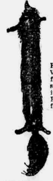
Fox Scarf—Very stylish for the fall suit or dress in Taupe or Rose shade, for 18.50