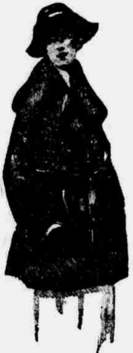
Sealine Coat—36-inch length—large shawl collar and bell cuffs of opossum; also belt "full sweep." $98