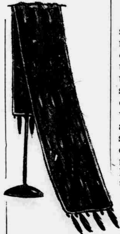
Jap Mink Stole—Rich dark brown; 14x32 pockets and trimmed with 22 claws and 27 tails. $98