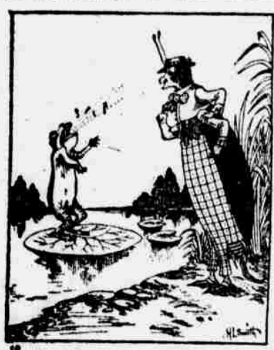
And then he would begin again, exactly as before.

CHAPTER XVIII. Mr. Cricket Frog's Trick. "What's the matter? Are you hurt?" Chirpy Cricket called to Mr. Cricket Frog from the bank of the duck-pond.