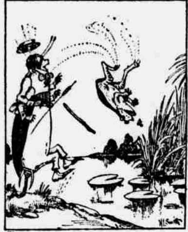
For Mr. Cricket Frog did not answer him.

"You're a sensible person!" Chirpy Cricket cried. He did not know that the reason why Mr. Cricket Frog stayed on the ground was because his feet were not suited to climbing trees. He couldn't have got up a tree if he had tried. "Aren't you afraid of falling off that lily-