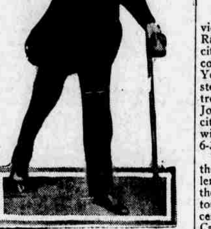
Ambassador Harvey Tries Out His Pitching Arm.

Colonel George Harvey, United States ambassador to England, today started the first ball in the July 4 base ball game at Stanford Bridge, England, between nine representing the American forces on the Rhine and the American navy in European waters.