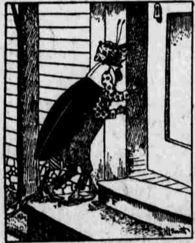
Maybe he wanted to punish him.

Johnnie Green's Guest. There were enough night noises before Chirpy Cricket came to live in the farmyard. What with Solomon Owl's hooting, his cousin Simon Screecher's quavering call, and the musical Frog's family's concerts in Cedar Swamp, it was a wonder that Johnnie Green ever managed to fall asleep. The Katydid alone were almost enough to drive anybody frantic—if he let himself listen to them—with their everlasting cry of Katy did, Katy did; she did, she did. Johnnie Green himself said he wished the Crickets had gone some-