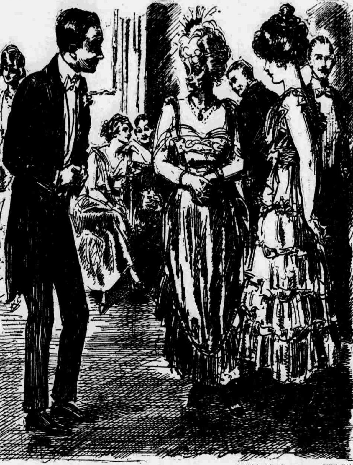
When I First Saw You I Couldn't Believe It Possible That You Were The Mother Of Such A Handsome Daughter—No—I Didn't Mean That, Of Course. "No, Of Course Not. You Mean You Didn't Think It Possible For Such A Handsome Girl As My Daughter Is To Have Such A Mother As I Am."

By Charles Dana Gibson Copyright, Life Pub. Co.