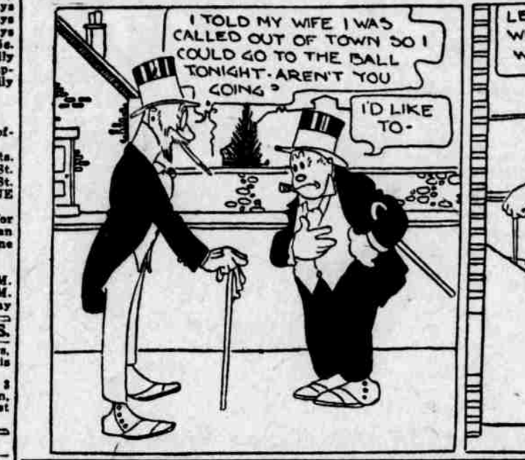
6-27 © 1921 by INT'L FEATURE SERVICE, INC.