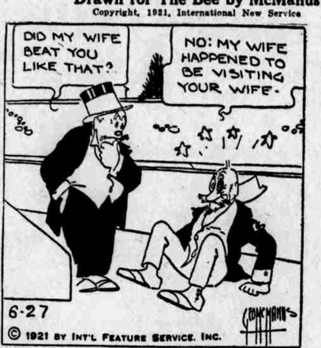
6-27 © 1921 by INT'L FEATURE SERVICE, INC.